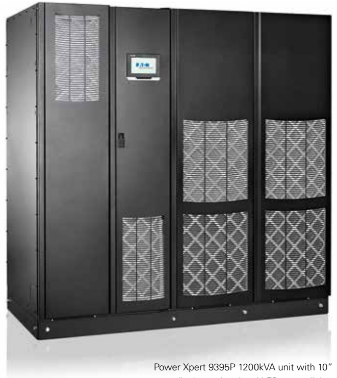
Power Xpert 9395P 1200kVA unit with 10" display and optional LED status lights