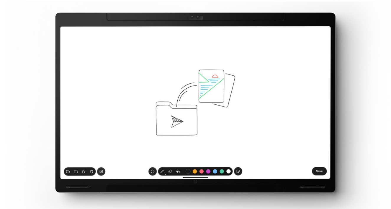
Figure 4. Digital whiteboarding on Webex Board Pro