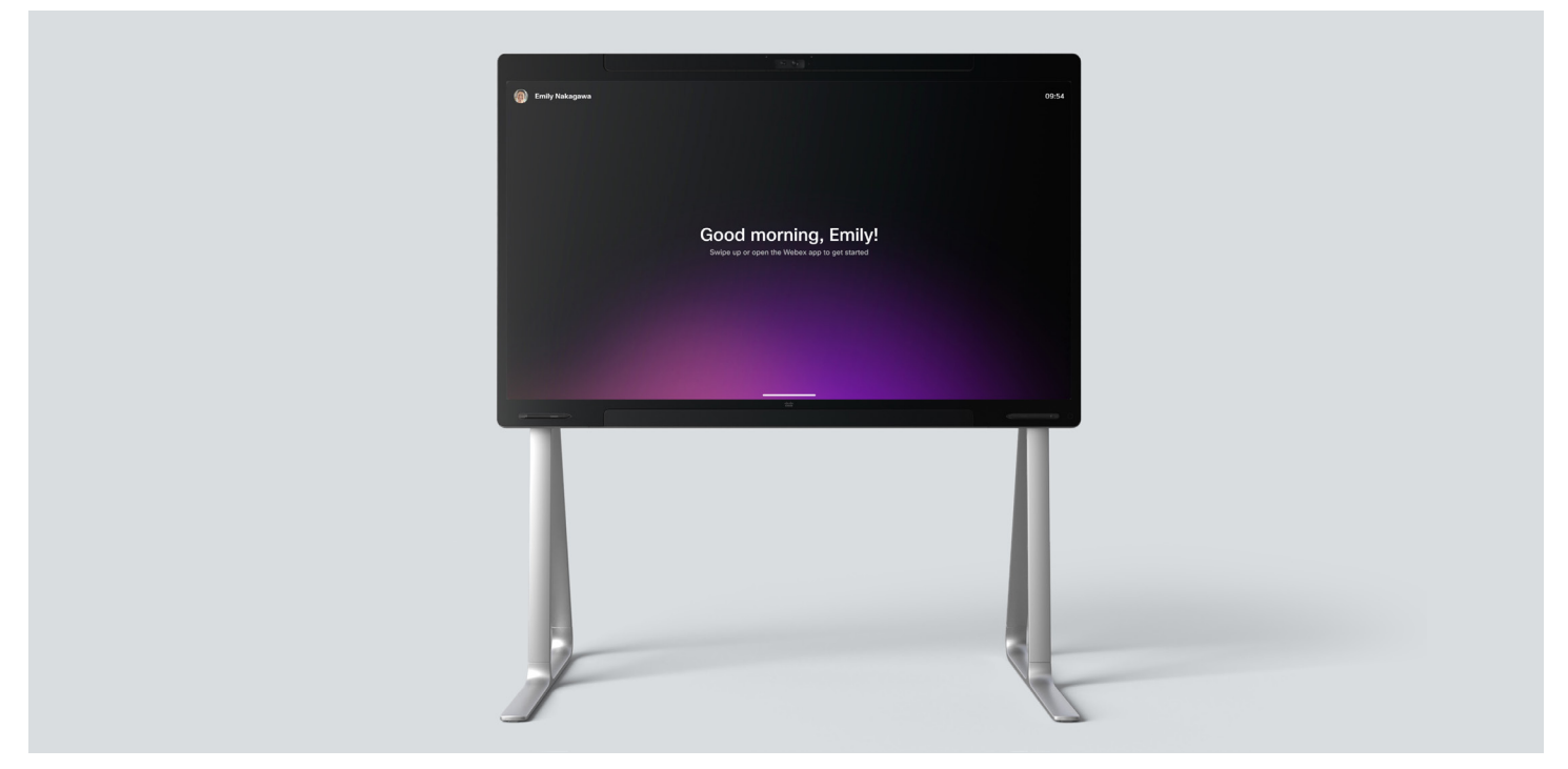
Figure 2. Webex Board Pro on floor stand "wakes up"

Available in 55-inch and 75-inch models, the Webex Board Pro helps your teams collaborate in a variety of meeting spaces and connect with remote members to become more productive. The Board Pro draws its power from the Webex platform, runs on RoomOS, and is fully optimized for Webex for the best collaboration experience.