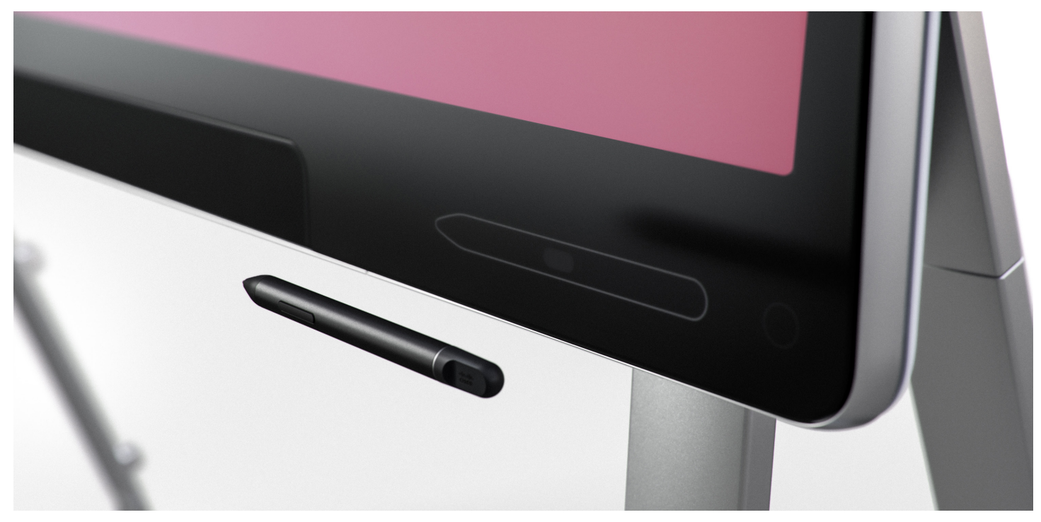
Figure 1. Two intuitive styluses with magnetic attachment to the Board Pro