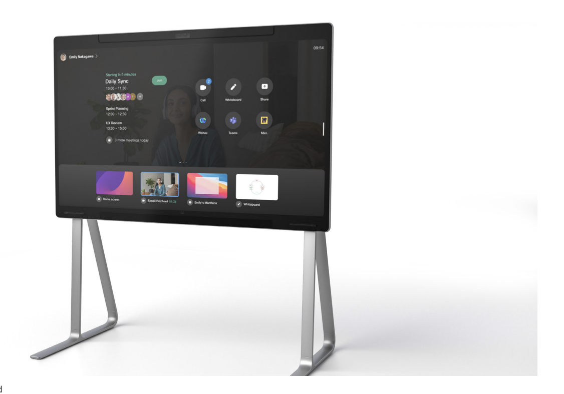
Figure 3. Webex Board Pro on floor stand