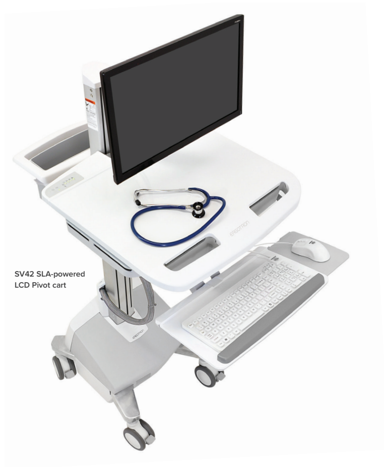
SV42 SLA-powered LCD Pivot cart

SLA OR LIFE BATTERY POWERED DOCUMENTATION CART WITH OPTIONAL DRAWERS