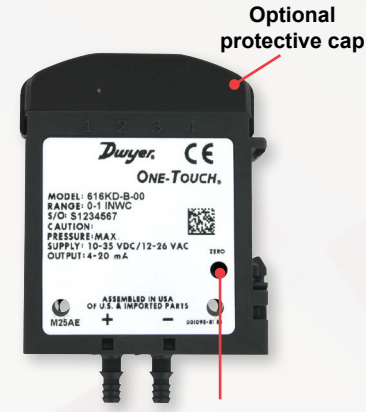
Side mount zero