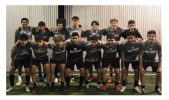
2006 Boys came to play, ending their State Cup group play with 1-0-2 record!

Congratulations to all teams, coaches and players! Let's go United!