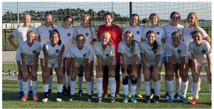
2005 Girls are moving onto Semi-finals after going 2-1 in group play! Catch them on Friday, November 6<sup>th</sup>.