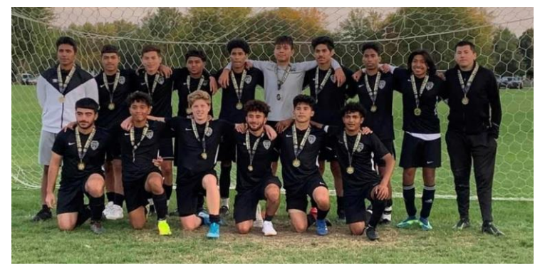
After going 1-0-2 in group play, catch the 2002 Boys in the Finals on November 4<sup>th</sup>.

Congratulations to the following teams who are continuing on to Semi-finals or Finals!