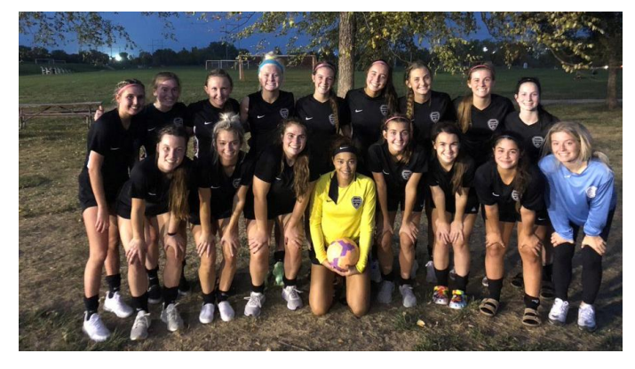
2002 Girls performed well, including playing in to earn their spot!

Two more of our teams had strong showings in State Cup as well!