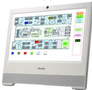
Call System e.g. for nurses (hospital) or security personnel