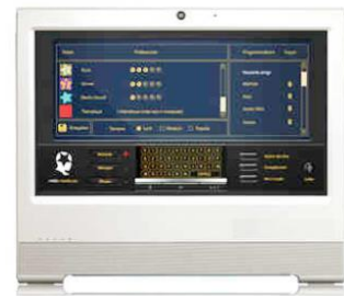
POS Radio Playing advertising and music