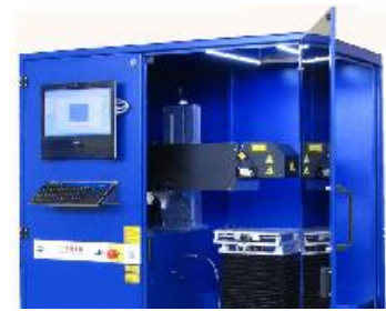
Visualisation e.g. for industrial production machines