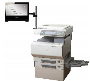
Device Control e.g. for copy machines