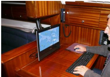
On a boat e.g. for navigation and entertainment