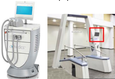
Device Control e.g. for health services or fitness equipment