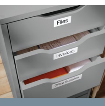
Shelving and Draws