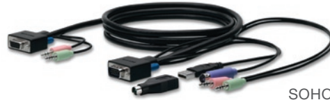
SOHO cable kits are included in the box