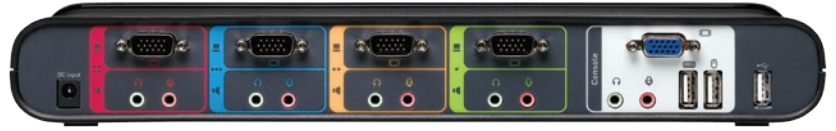
Model depicted above is F1DS104Lea.