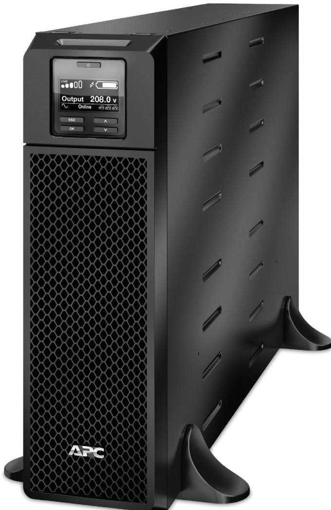
[ SRT5KXLT shown ]