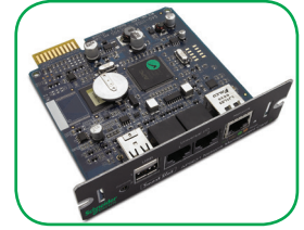
Network Management Card

SRT008: APC Smart-UPS SRT 8/10 kVA PDU, 208 V (6) L6-30