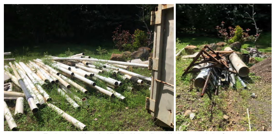
Trash removed from the Kikokiko Makanali, and Kaaiea areas during Q3 2022

previous fieldwork. In the third quarter of 2022, EMI continued to be vigilant about monitoring and removing unused material and removed a number of pipes from the areas covered by the RPs which is pictured below.