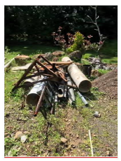
Trash removed from the Kikokiko Makanali, and Kaaiea areas during Q3 2022

EMI will also continue removing any equipment and excess materials it brings into the license area to perform work on the ditch system as soon as the job(s) is completed, which includes diversion modifications required to meet the 2018 IIFS.