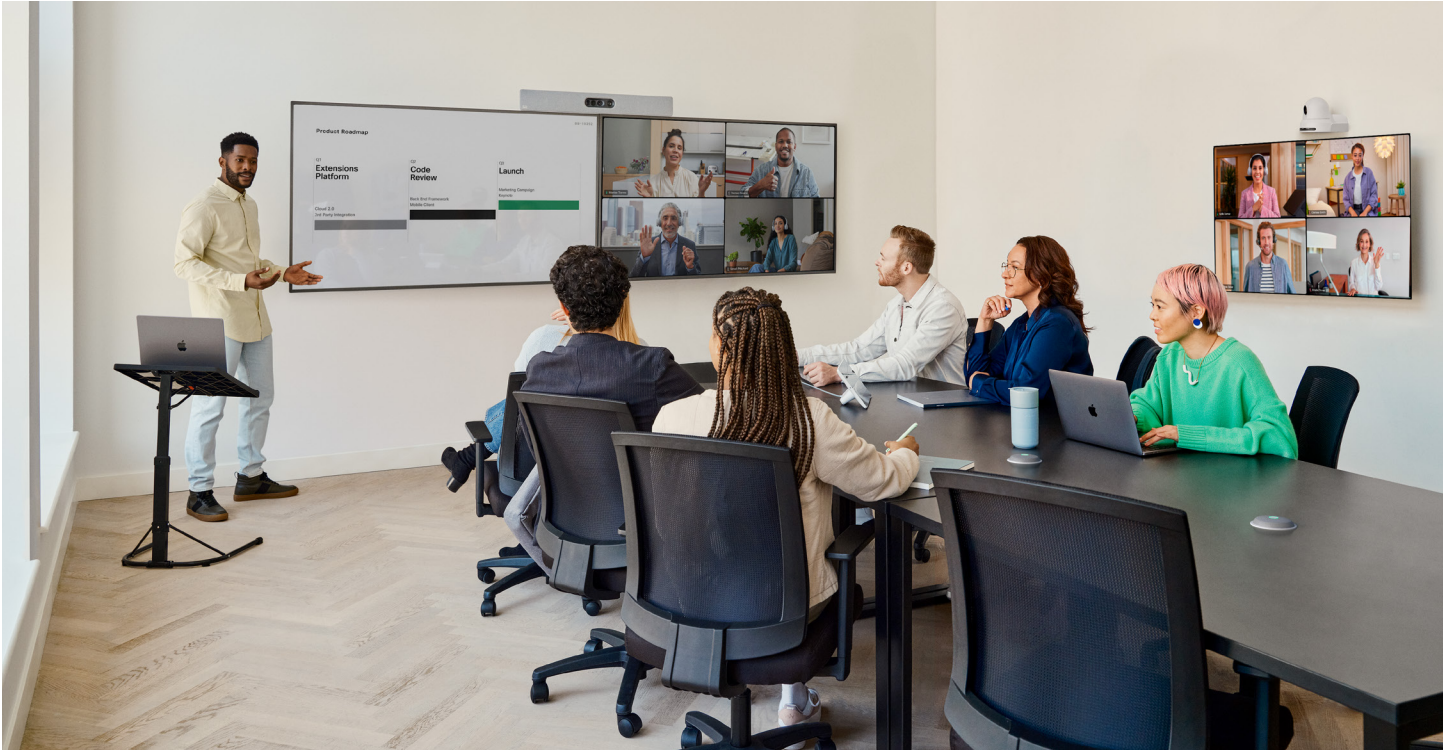
Figure 3. Cisco Room Kit EQ in a large training room featuring the Quad Camera, the PTZ 4K Camera, the Room Navigator tabletop touch controller, and Cisco Table Microphone Pro devices.