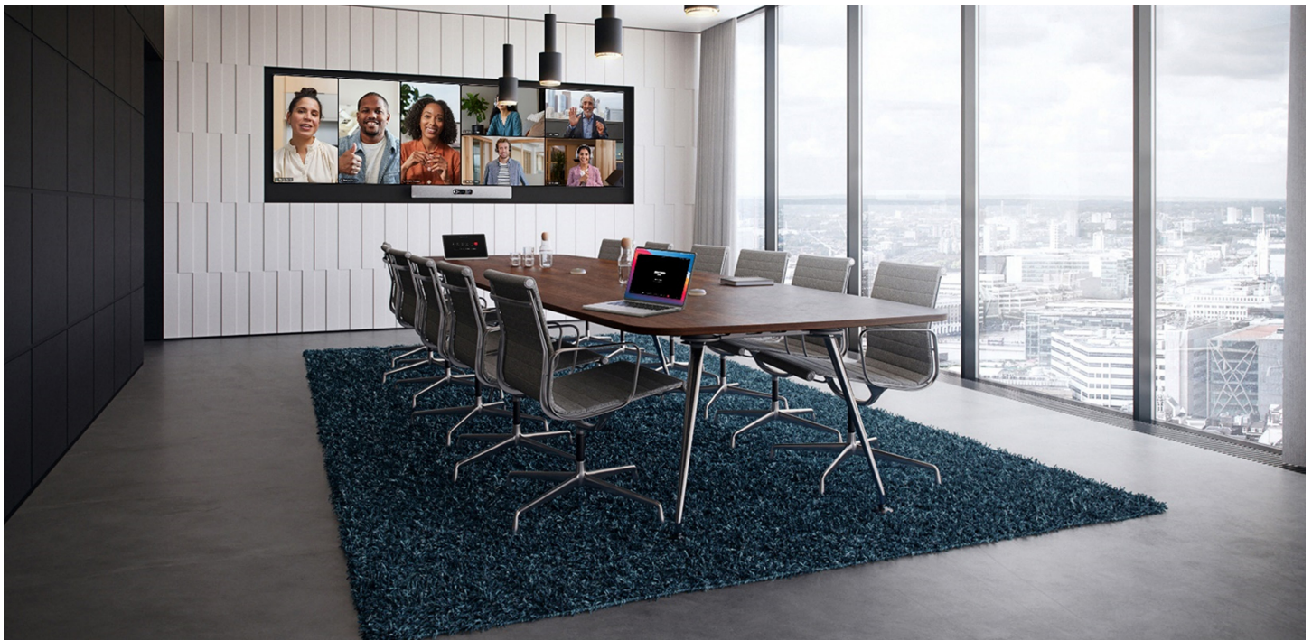
Figure 1. The Cisco Room Kit EQ in a conference room with the Quad Camera, the table-stand Room Navigator, and the Cisco Table Microphone Pro.

The Room Kit EQ provides optionality and extensibility with a highly modular setup to easily add touch controllers, cameras, speakers, microphones, and other room peripherals – easing the configuration and scaling of complex, multi-component audiovisual environments. This solution is rich in functionality and experience yet easy to deploy, maintain, and scale to your workspaces – and comes with unified cloud device management and workspace analytics in Control Hub.