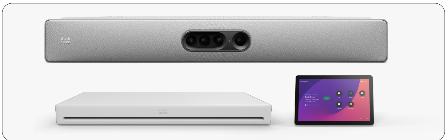
Figure 2. Main components of the Cisco Room EQ bundle: Cisco Codec EQ, Cisco Quad Camera, and the Cisco Room Navigator touch controller