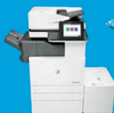
3,000-sheet side high-capacity input 18