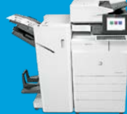
Booklet finisher 20