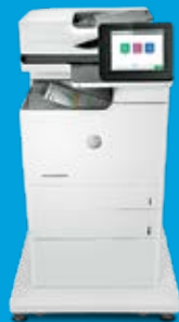
Printer stand and cabinet