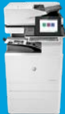
2,000-sheet high-capacity input