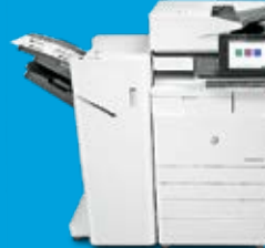
Stapler/stacker/hole punch 20