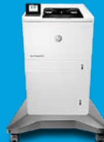
2,500-sheet HCI and stand