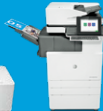
Inner finisher hole punch 19