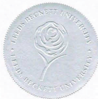
Secretary and Registrar