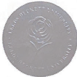
Secretary and Registrar