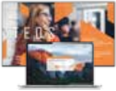
Connect for TEOS license TEC-SC100