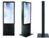
Totems TOT-XXBZ40H-IR10 TOT-XXBZ40H-CA10