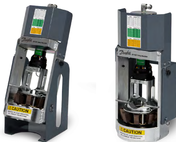
AVAILABLE WITH BENCH AND TRUCK MOUNT BRACKETS