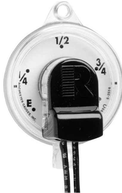
U.S. & Foreign Patents

The sender is mounted onto the Rochester Junior™ gauge with #0040-00416 stainless steel dial screws (6-32 X 5/16”). An additional item available to ensure weatherproof connections from the Twinsite™ to the receiver is heat shrink solder sleeves part number 0025-00495.