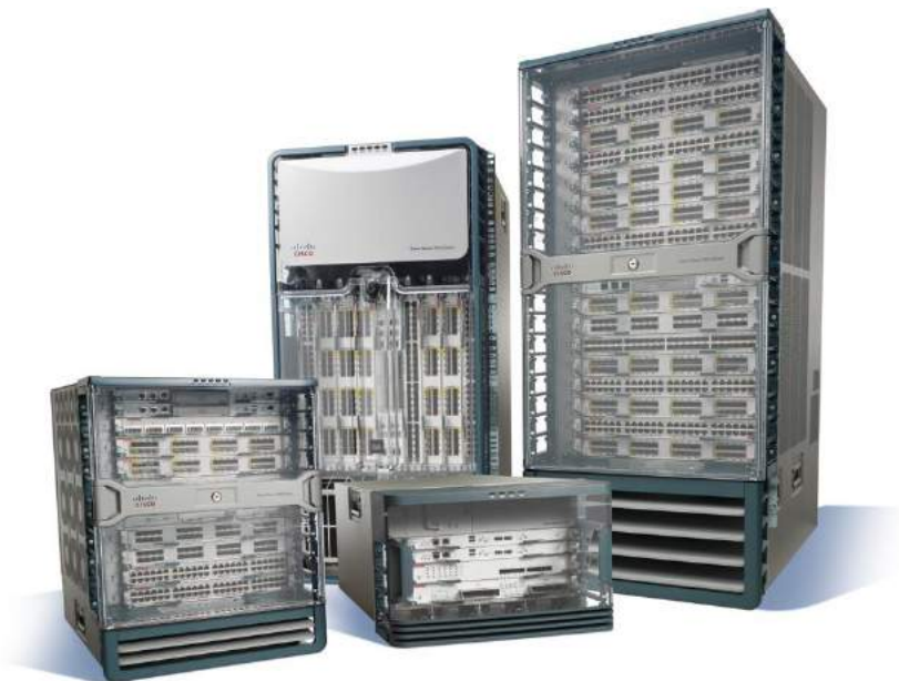
Figure 1. Cisco Nexus 7000 Series

The first in the next generation of switch platforms, the Cisco Nexus 7000 Series (Figure 1) provides integrated resilience combined with features optimized specifically for the data center for availability, reliability, scalability, and ease of management.