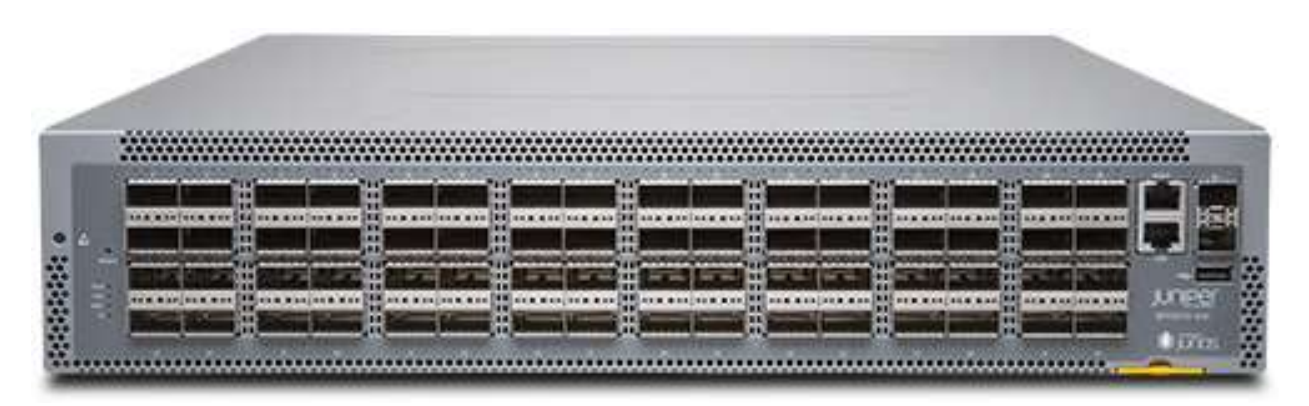
Figure 7 - QFX 5210-64C front view