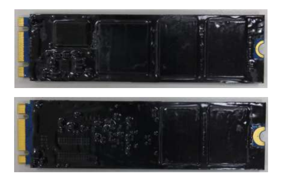
<u>Exhibit 3</u> - Specification of the PS3112-S12 M.2 2280 SATA NAND FLASH SSD (D3) Series Cryptographic Boundary (From top to bottom: top side, bottom side).