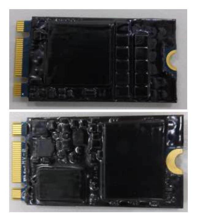
<u>Exhibit 5</u> - Specification of the PS3112-S12 M.2 2242 SATA NAND FLASH SSD Series Cryptographic Boundary (From top to bottom: top side, bottom side).