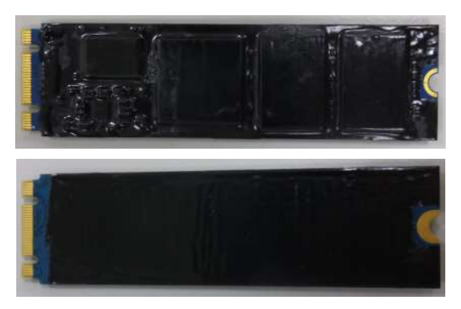
<u>Exhibit 4</u> - Specification of the PS3112-S12 M.2 2280 SATA NAND FLASH SSD (S3) Series Cryptographic Boundary (From top to bottom: top side, bottom side).