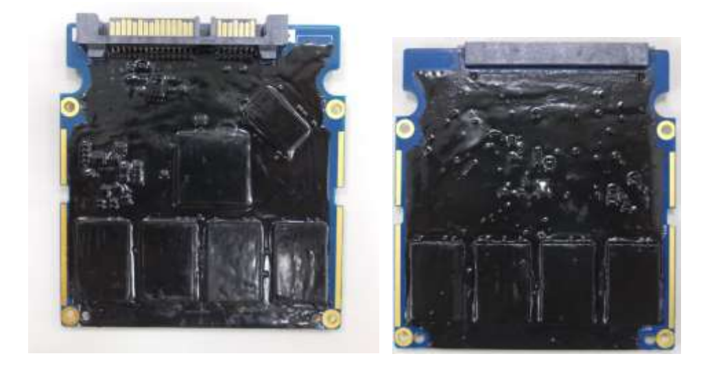
<u>Exhibit 2</u>- Specification of the PS3112-S12 2.5-INCH SATA NAND FLASH SSD Series Cryptographic Boundary (From left to right: top side, bottom side).