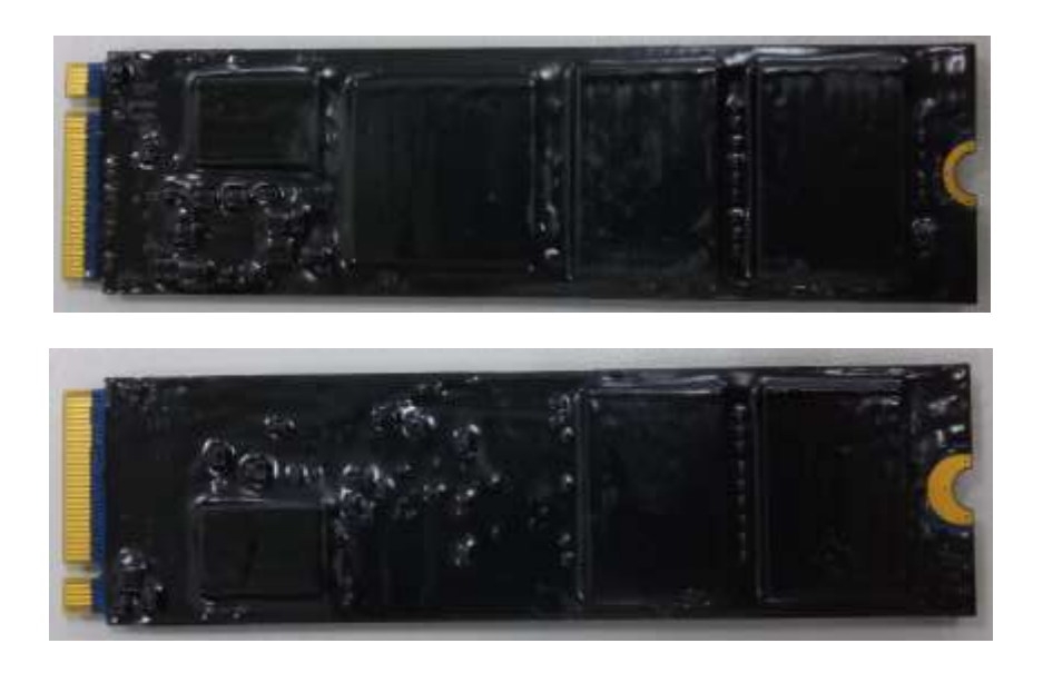
<u>Exhibit 6</u> - Specification of the PS5012-E12 M.2 2280 NVMe NAND FLASH SSD Series Cryptographic Boundary (From top to bottom: top side, bottom side).