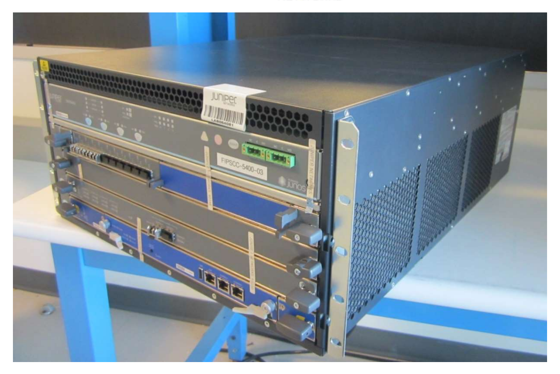
Figure 9 – SRX5400 (Front/Top)