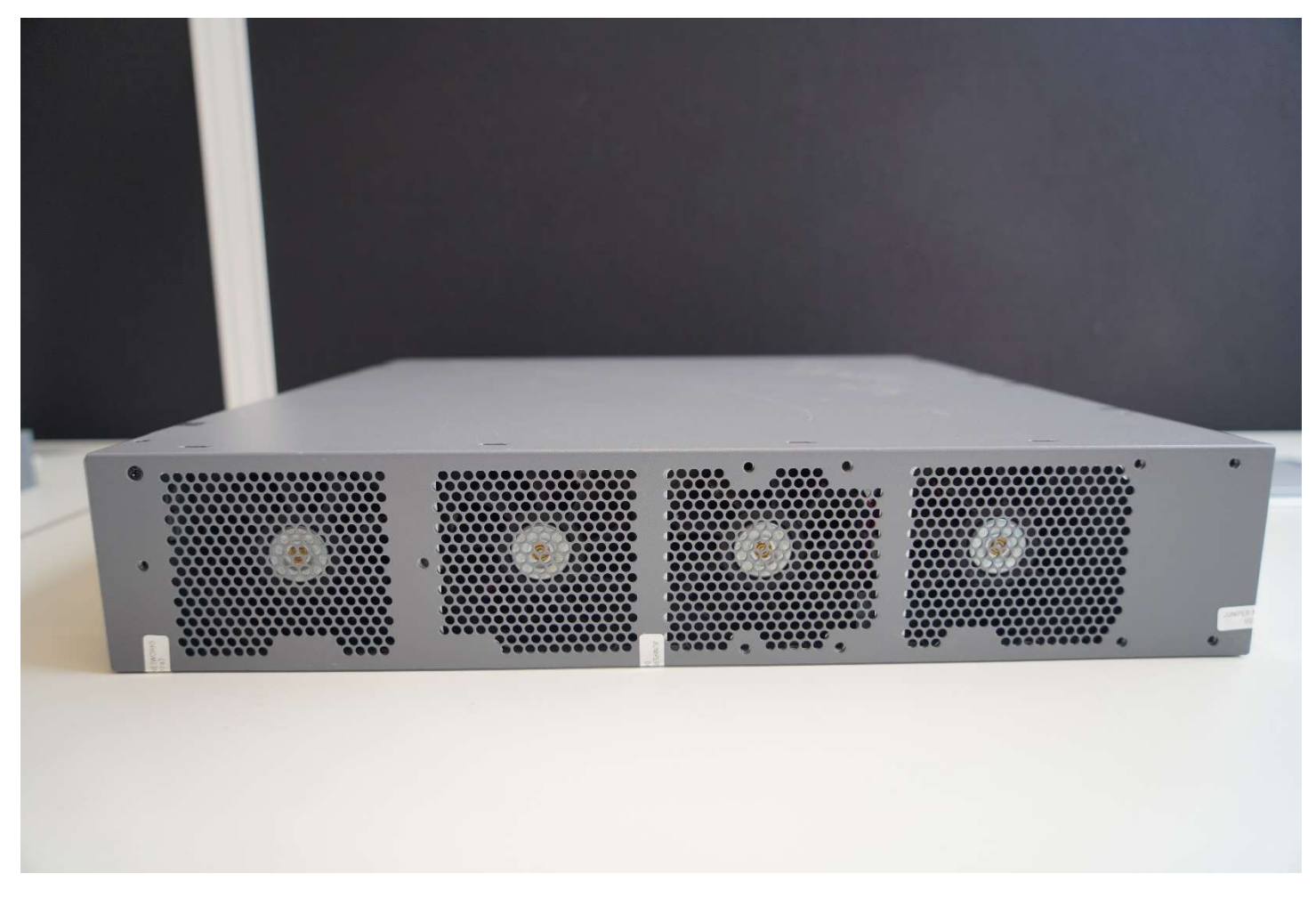
Figure 24 – SRX550 Tamper-Evident Seal Placement (Side, Three a side (6) Seals)