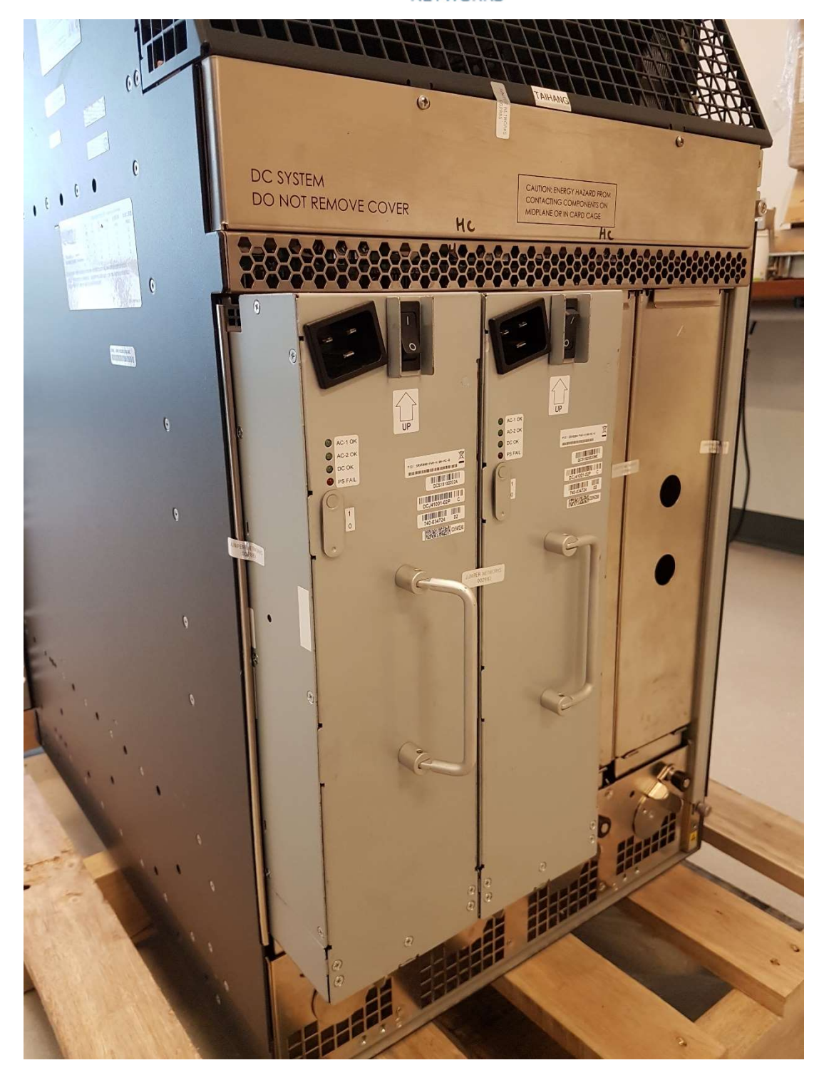
Figure 32 - SRX5800 Tamper-Evident Seal Locations (Rear, Six (6) Seals)