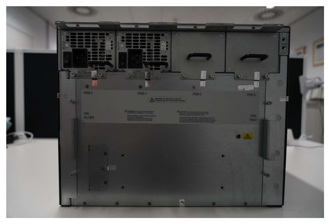
Figure 29 - SRX5600 Tamper-Evident Seal Locations (Rear, Nine (9) Seals)