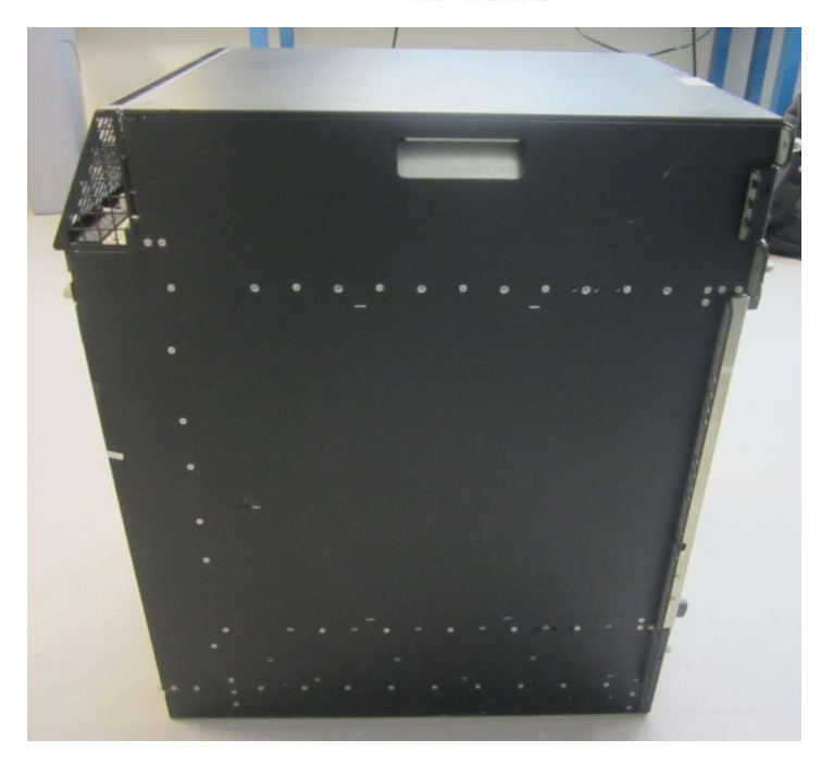
Figure 16 - SRX5800 (Left)

The following table maps each logical interface type defined in the FIPS 140-2 standard to one or more physical interfaces.