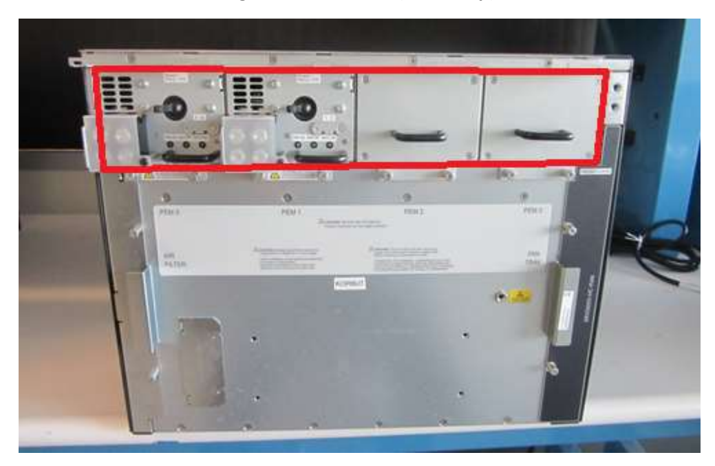
Figure 12 – SRX5600 (Rear)