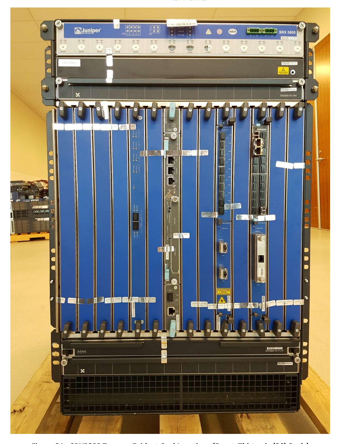
Figure 31 - SRX5800 Tamper-Evident Seal Locations (Front, Thirty-six (36) Seals)