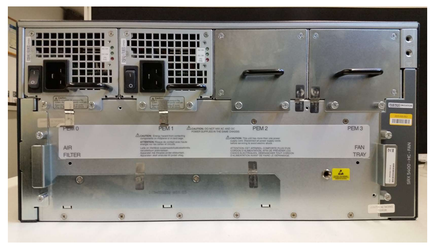
Figure 27 - SRX5400 Tamper-Evident Seal Locations (Rear, Ten (10) Seals)