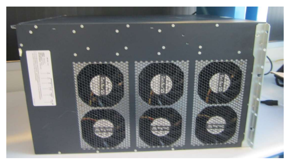
Figure 13 – SRX5600 (Left)