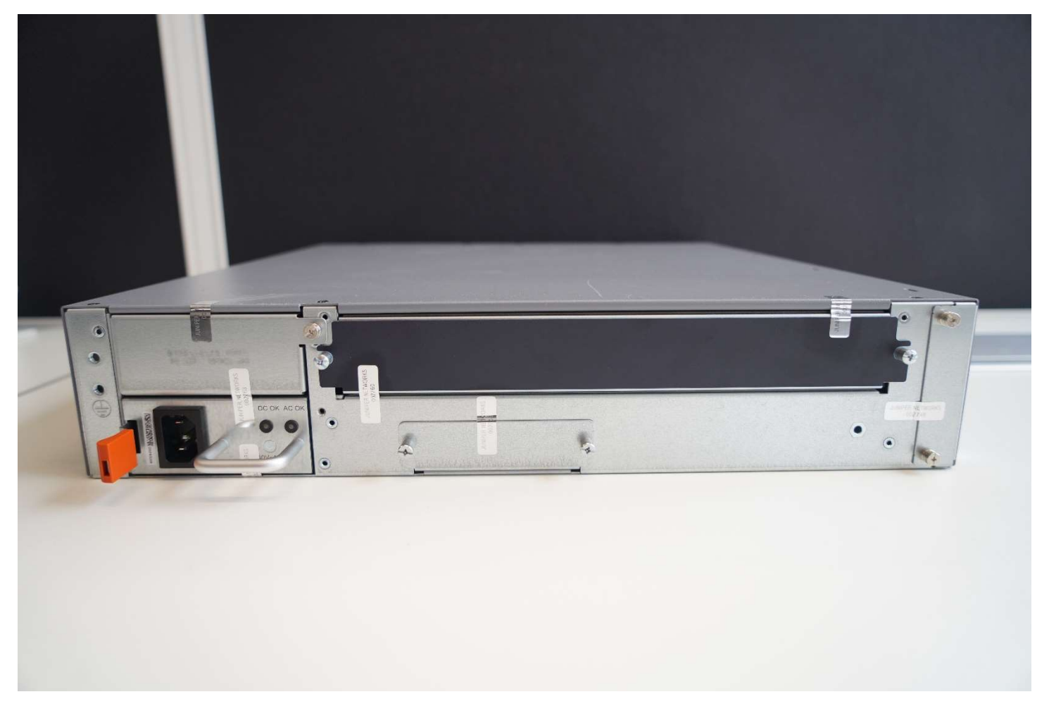
Figure 25 – SRX550 Tamper-Evident Seal Placement (Rear, Seven (7) Seals)