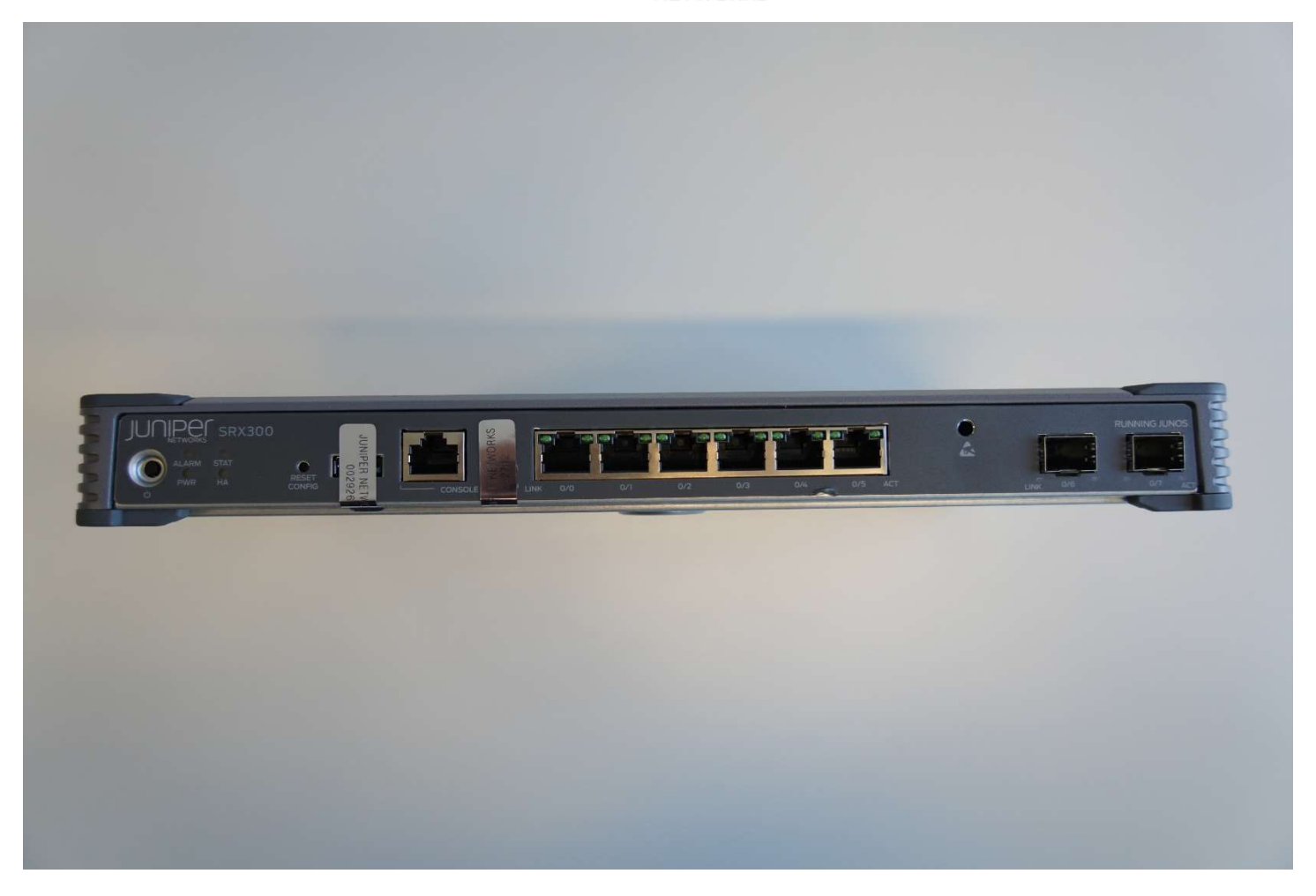
Figure 18 - SRX300 Tamper-Evident Seal Placement (USB Ports (2) Seals)