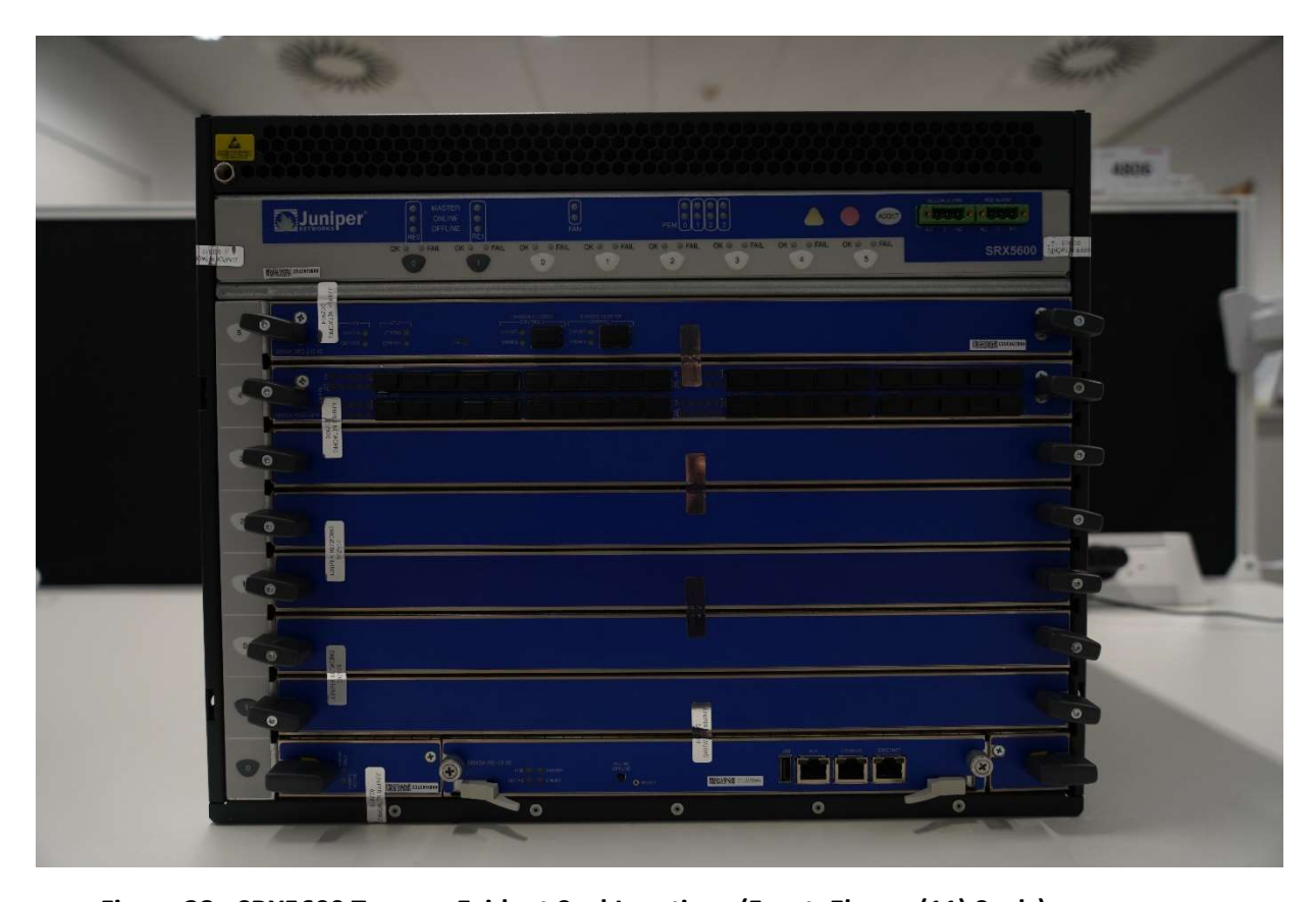
Figure 28 - SRX5600 Tamper-Evident Seal Locations (Front, Eleven (11) Seals)