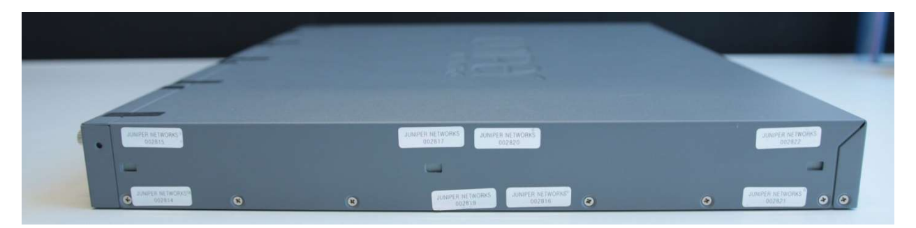
Figure 21 - SRX340/SRX345 Tamper-Evident Seal Placement (Side Panels, Eight on each side – Sixteen (16) Seals)