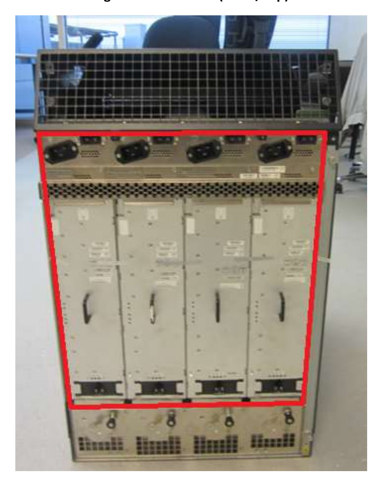
Figure 15 – SRX5800 (Rear)