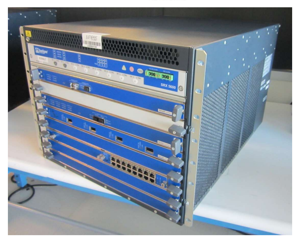
Figure 11 – SRX5600 (Front/Top)