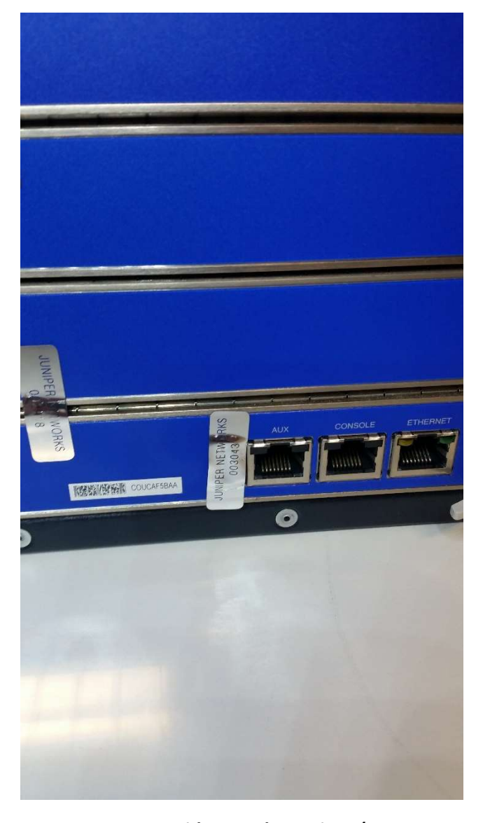
Figure 30 - SRX5600 Tamper-Evident Seal Locations (USB Port, One (1) Seal)