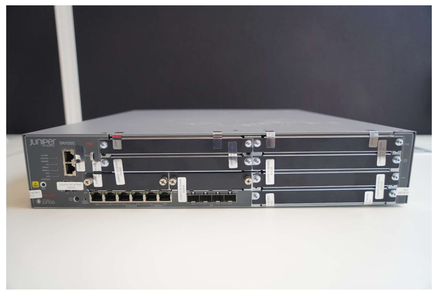
Figure 23 – SRX550 Tamper-Evident Seal Placement (Front, Fifteen (15) Seals)