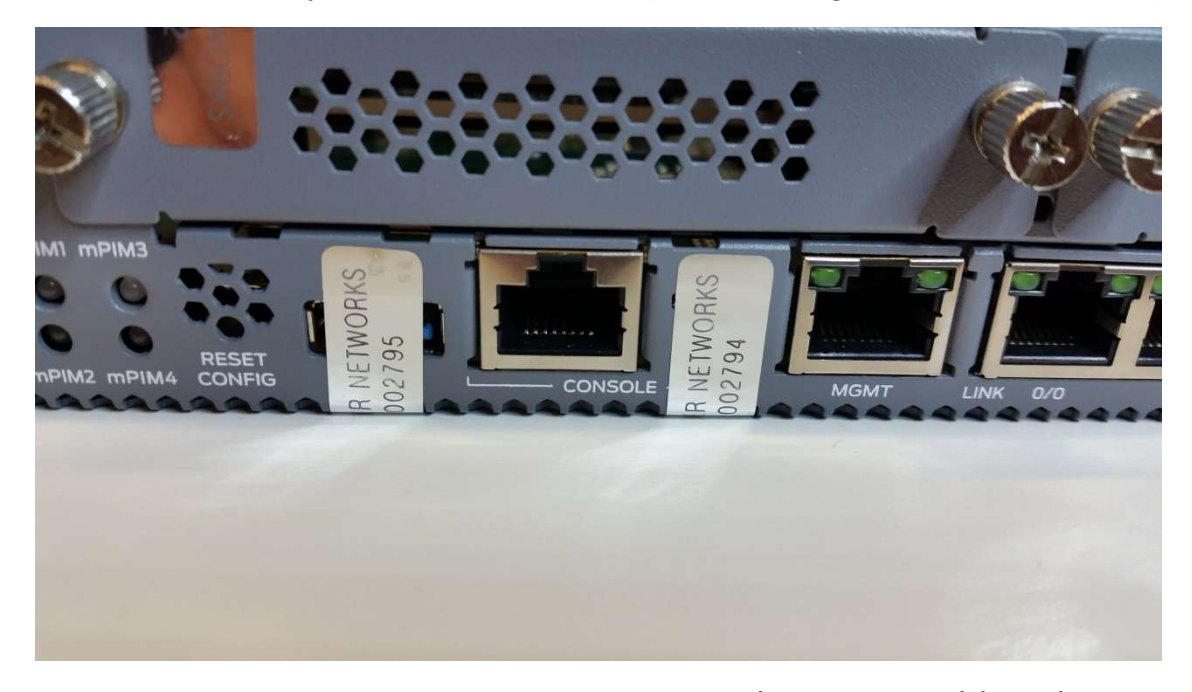
Figure 22 - SRX345 Tamper-Evident Seal Placement (USB Ports, Two (2) Seals)