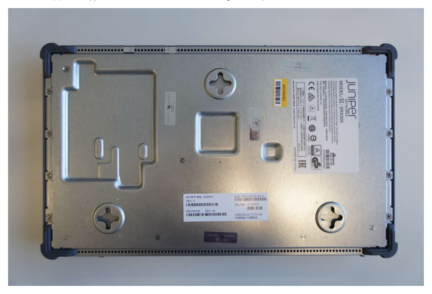
Figure 17 - SRX300 Tamper-Evident Seal Placement (Chassis Screws (4) Seals)