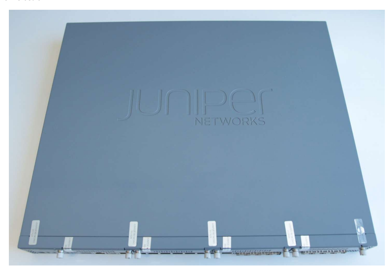
Figure 19 - SRX340/SRX345 Tamper-Evident Seal Placement (Top Cover, Nine (9) Seals)