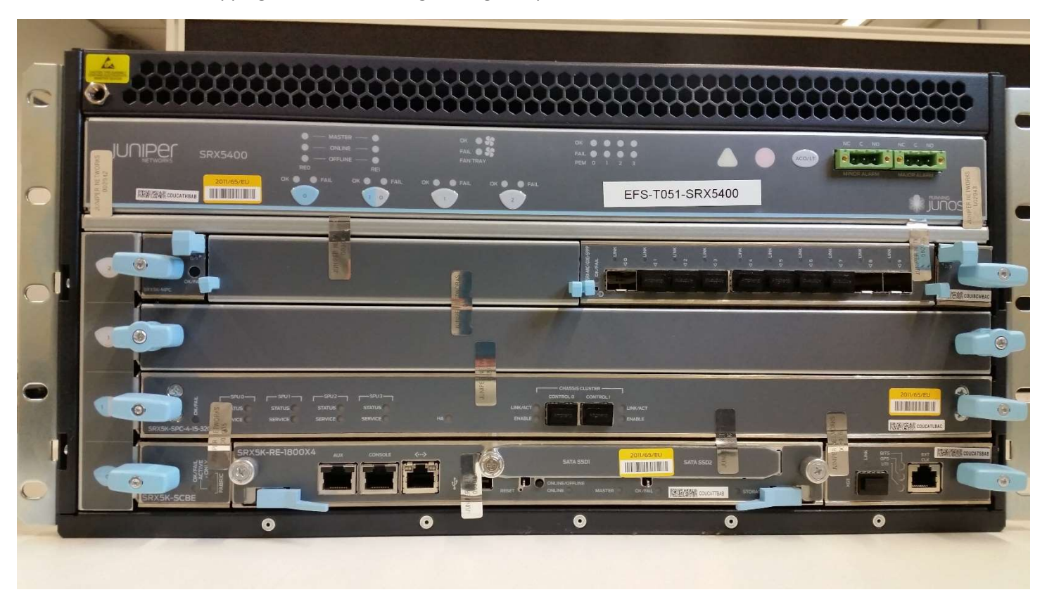
Figure 26 - SRX5400 Tamper-Evident Seal Locations (Front, Ten (10) Seals)