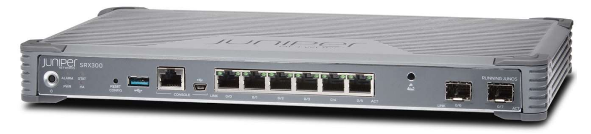
Figure 1 - SRX300 (Front)

The physical forms of the module's various models are depicted in Figures 1-16 below. For all models the cryptographic boundary is defined as the outer edge of the chassis.