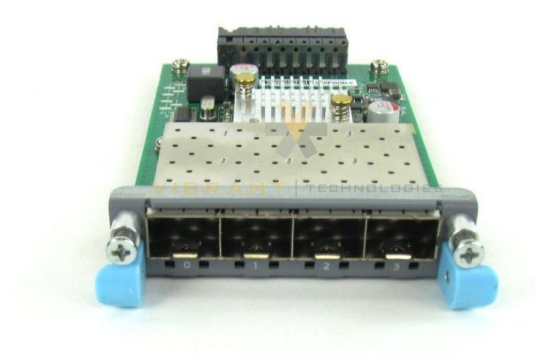
Figure 6 EX-UM-4X4SFP

The EX-UM-4X4SFP is for use in the EX4300-24 and the EX4300-48