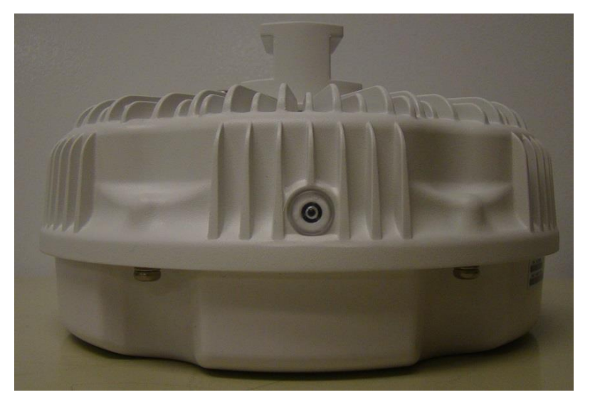
Figure 7 - Aruba IAP-277

This section introduces the Aruba IAP-277 Wireless Access Point (AP) with FIPS 140-2 Level 2 validation. It describes the purpose of the AP, its physical attributes, and its interfaces.