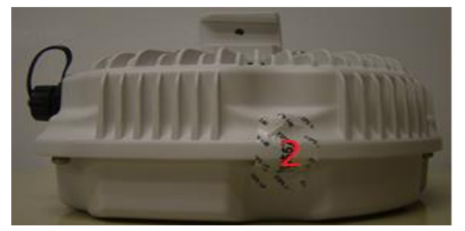
Figure 23 - Right Side View of IAP-277 with TELs