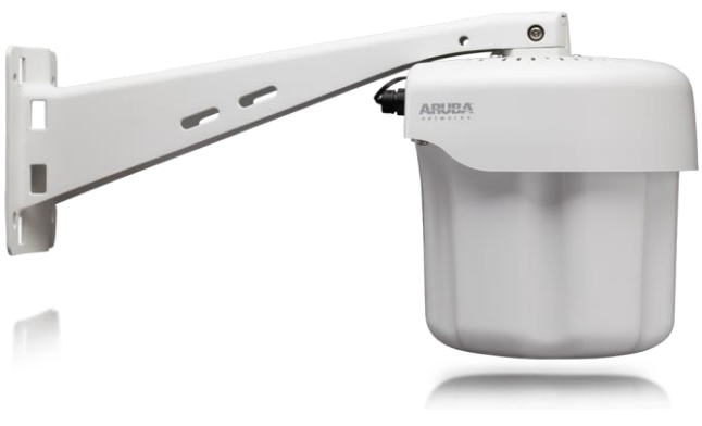
Figure 6 - IAP-275

This section introduces the Aruba IAP-275 Wireless Access Point (AP) with FIPS 140-2 Level 2 validation. It describes the purpose of the AP, its physical attributes, and its interfaces.