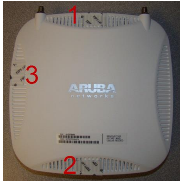
Figure 25 - RAP-108/109

Following is the TEL placement for the RAP-108 and RAP-109: