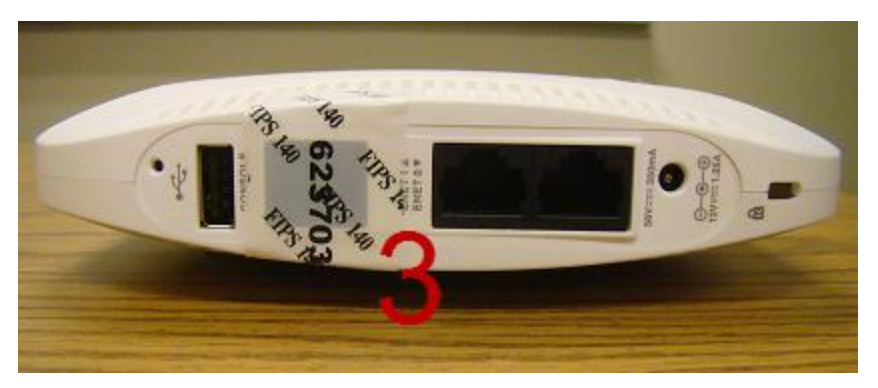
Figure 26 - RAP-108/109