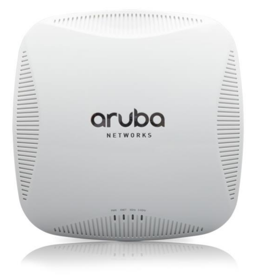
Figure 2 - Aruba IAP-215

This section introduces the Aruba IAP-215 Wireless Access Point (AP) with FIPS 140-2 Level 2 validation. It describes the purpose of the AP, its physical attributes, and its interfaces.