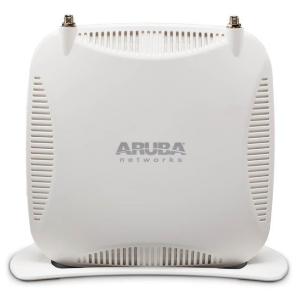
Figure 8 - RAP-108

This section introduces the Aruba RAP-108 Wireless Access Point (AP) with FIPS 140-2 Level 2 validation. It describes the purpose of the AP, its physical attributes, and its interfaces.