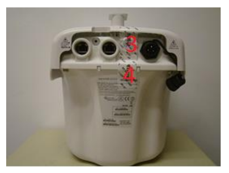
Figure 19 – Rear View of IAP-275 with TELs