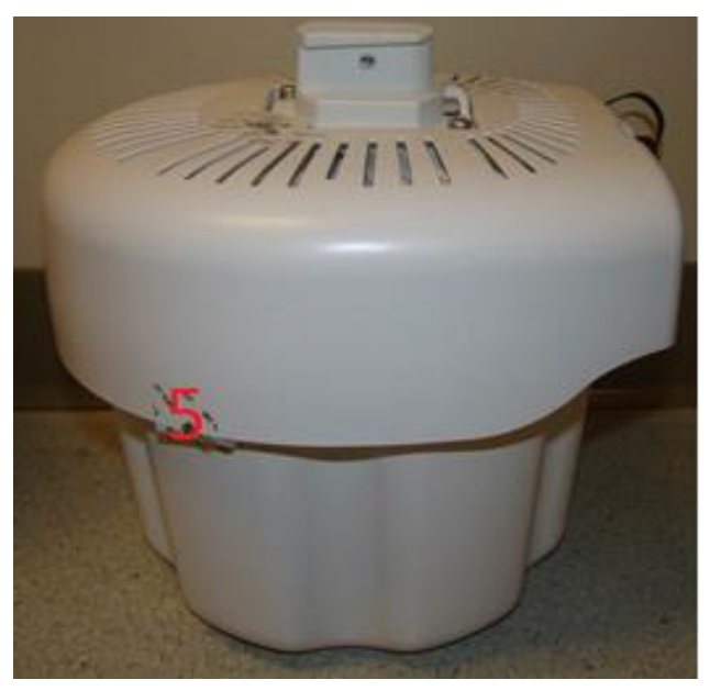
Figure 20 – Right Side View of IAP-275 with TELs