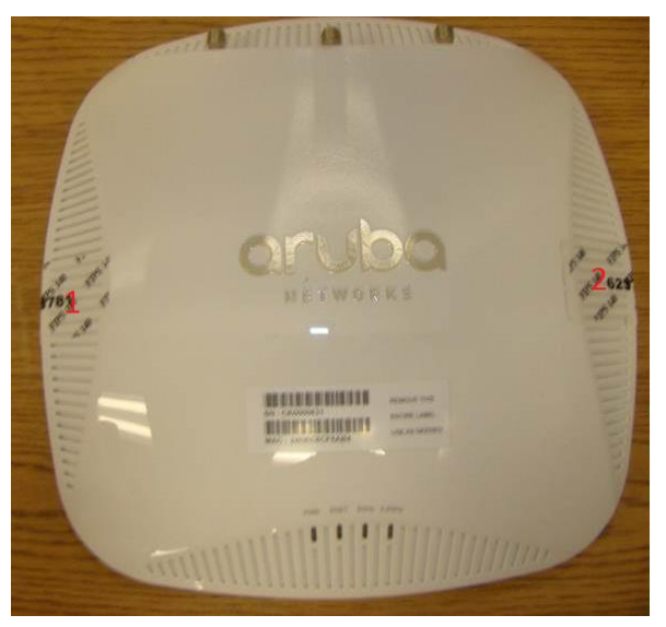
Figure 10 - Top View of IAP-214/215 with TELs

The IAP-214/215 requires 3 TELs. One on each edge (labels 1 and 2) and one covering the console port (label 3). See figures 10, and 11 for placement.