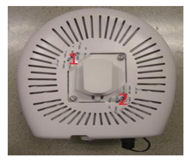
Figure 14 – Top View of IAP–274 with TELs