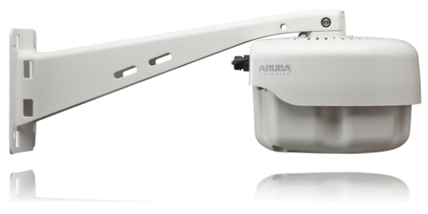
Figure 5 – IAP-274

This section introduces the Aruba IAP-274 Wireless Access Point (AP) with FIPS 140-2 Level 2 validation. It describes the purpose of the AP, its physical attributes, and its interfaces.