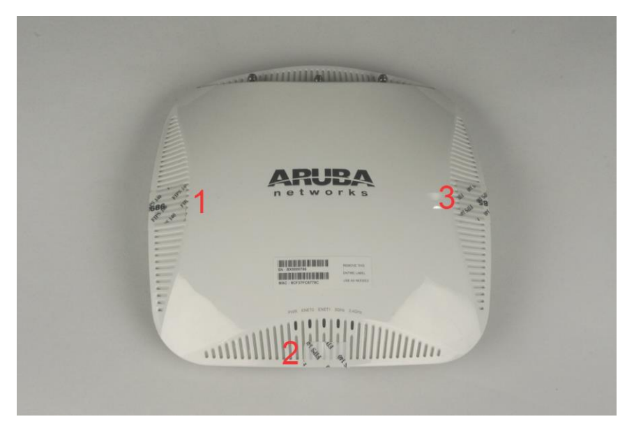
Figure 12: IAP-224/225 Front/Top view