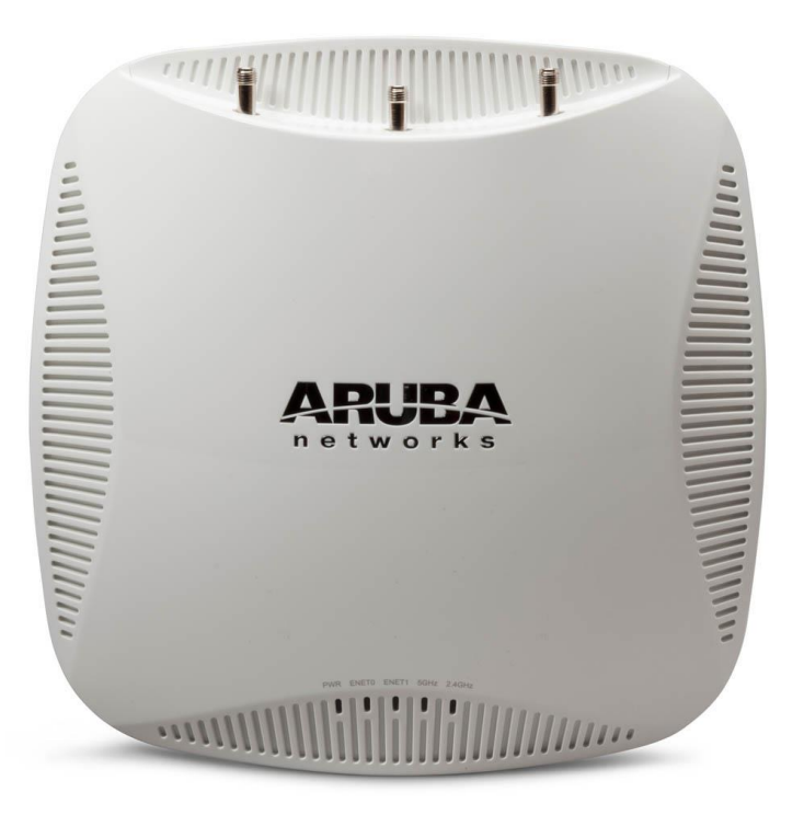
Figure 3 – IAP-224

This section introduces the Aruba IAP-224 Wireless Access Point (AP) with FIPS 140-2 Level 2 validation. It describes the purpose of the AP, its physical attributes, and its interfaces.