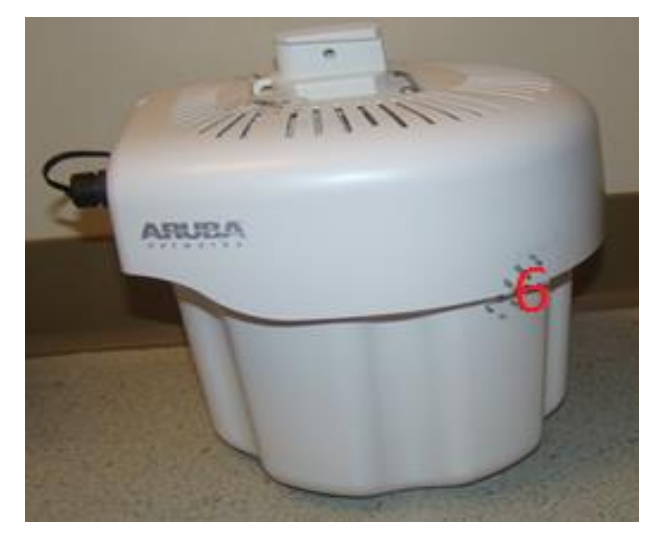
Figure 21 – Left Side View of IAP-275 with TELs