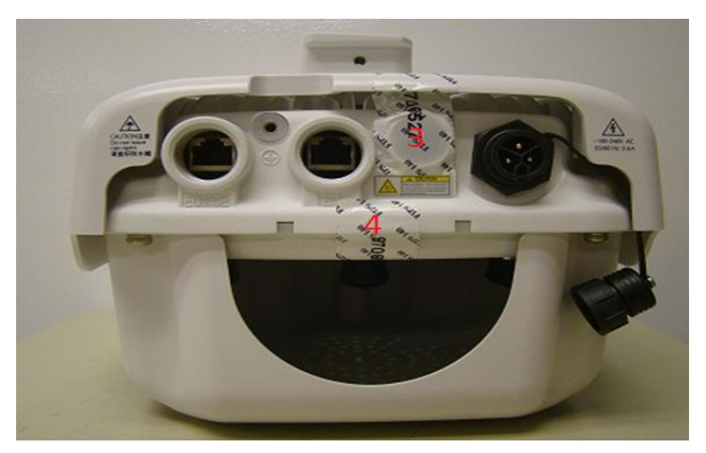
Figure 15 – Rear View of IAP-274 with TELs