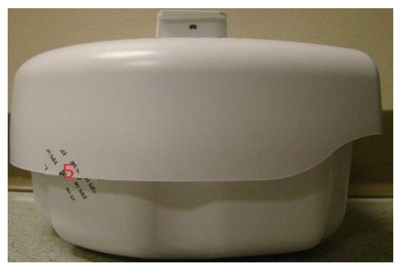
Figure 16 – Right Side View of IAP-274 with TELs