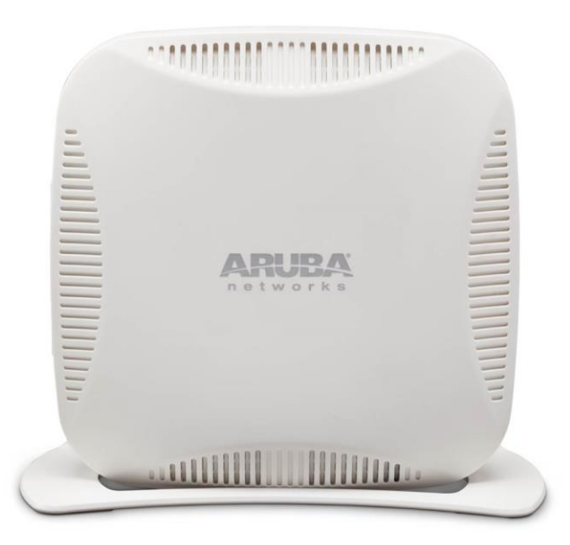
Figure 9 - RAP-109

This section introduces the Aruba RAP-109 Wireless Access Point (AP) with FIPS 140-2 Level 2 validation. It describes the purpose of the AP, its physical attributes, and its interfaces.