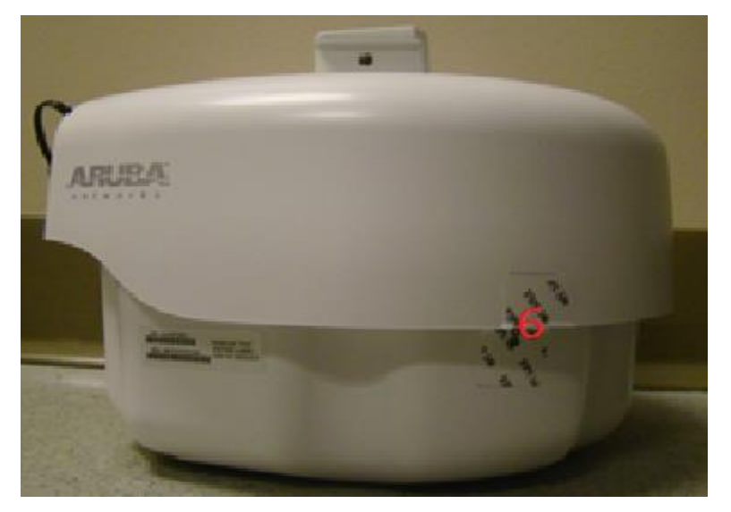
Figure 17 – Left Side View of IAP-274 with TELs