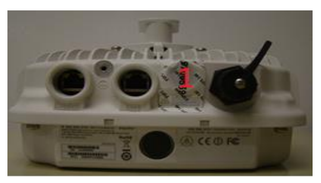
Figure 22 – Top View of IAP–277 with TELs

The IAP-277 requires a minimum of 3 TELS. One covering the console port (label 1) see Figure 22. Apply one label to each side sealing it to the bottom (labels 2 & 3), see figures 23 and 24 for placement.