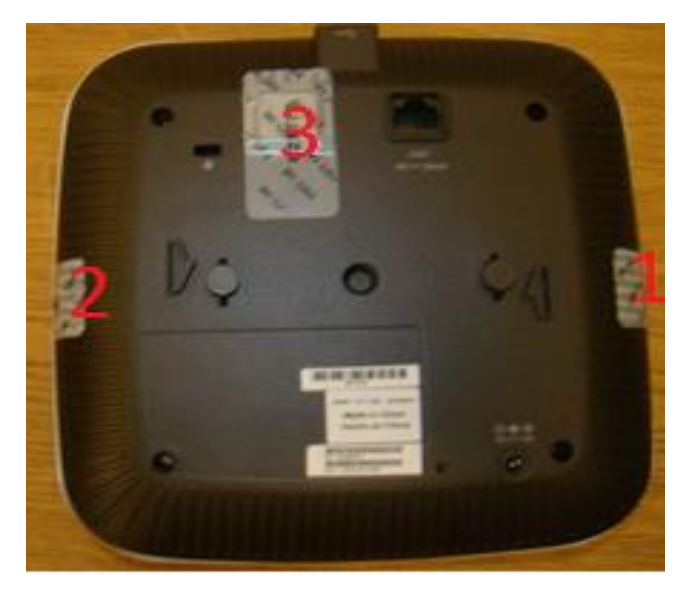
Figure 11 - Bottom View of IAP-214 with TELs