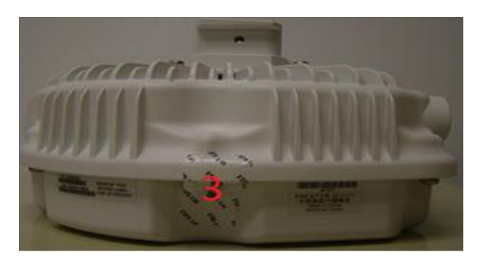
Figure 24 – Left Side View of IAP-277 with TELs