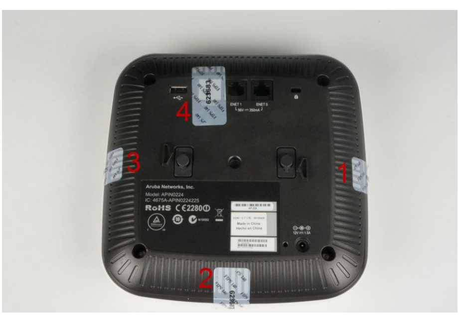
Figure 13: AP-224/225 Back/Bottom View