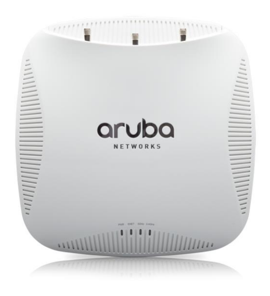
Figure 1 - Aruba IAP-214

This section introduces the Aruba IAP-214 Wireless Access Point (AP) with FIPS 140-2 Level 2 validation. It describes the purpose of the AP, its physical attributes, and its interfaces.