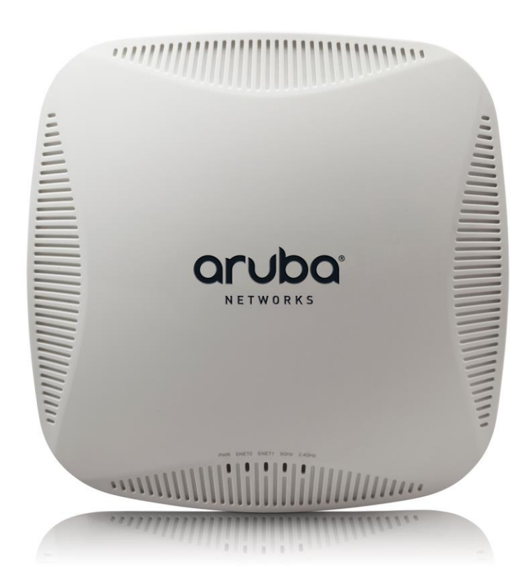
Figure 4 – IAP-225

This section introduces the Aruba IAP-225 Wireless Access Point (AP) with FIPS 140-2 Level 2 validation. It describes the purpose of the AP, its physical attributes, and its interfaces.