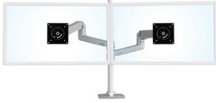
STANDARD CONFIGURATION SUPPORTS TWO DISPLAYS