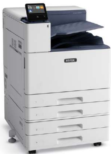
VersaLink® C8000W plus Two Tray Module