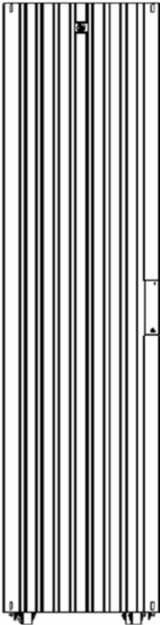
HP Rack 10000 G2 Series - front view

In addition to the universality of the new racks, important improvements have been made from the previous version, including improved and updated front door design with bright-aluminum finish; improved front and rear door handles and latches, and easier to handle three section side panels.