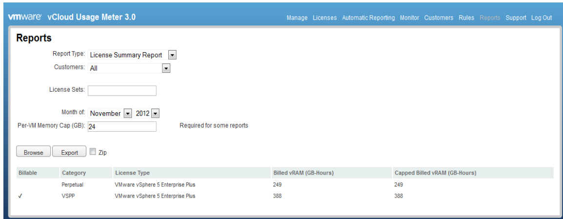
Figure 1. Sample License Summary Report filtered by month/year