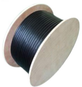
1000' Wood Reel Weight: 30 lbs.