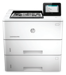
HP LaserJet Managed M506xm