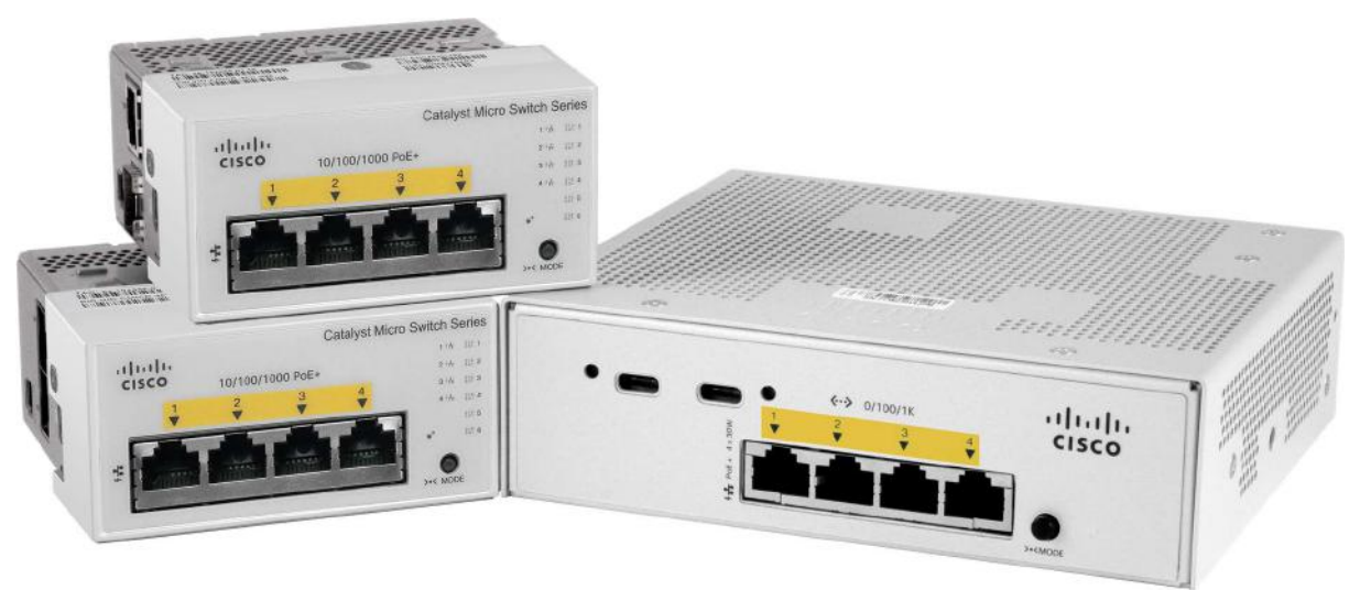
Figure 1. Cisco Catalyst Micro Switch Series Switches

Fiber to the desk, office, etc. (FTTx) is not a new concept. In this deployment scenario, the improved range of fiber optics over copper cables allows access switches to be deployed right next to the end devices, with uplinks connected directly to the main distribution frame, eliminating the need for an intermediate distribution frame on each floor. However, as access switches get closer to the end users, the requirements for operating noise and product footprint get stricter. Enter the Cisco Catalyst Micro Switches, a product family of small, fanless switches purpose-built for FTTx deployments. These switches offer flexible mounting options and open up a variety of network design and connectivity opportunities.