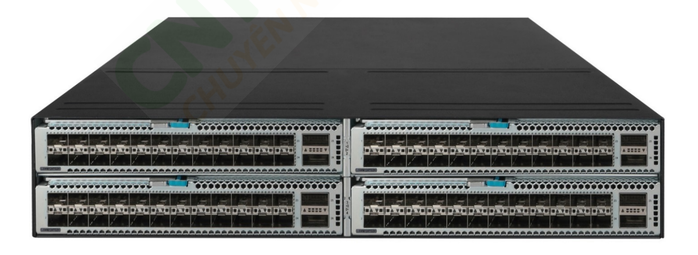
HPE FlexFabric 5945 4-slot Switch (JQ076A)