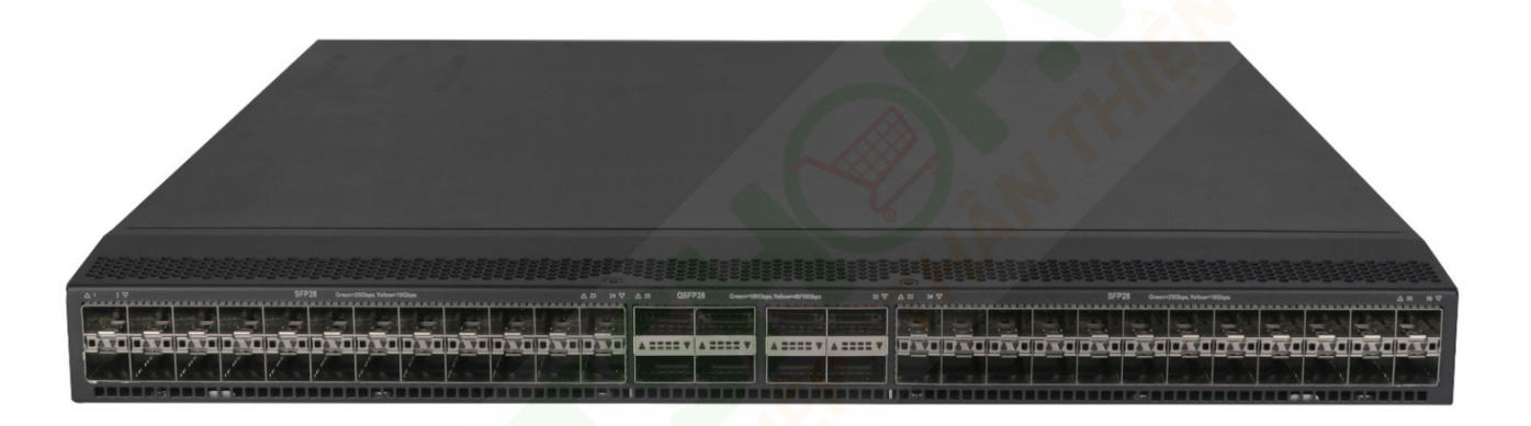
HPE FlexFabric 5945 48SFP28 8QSFP28 Switch (JQ074A)