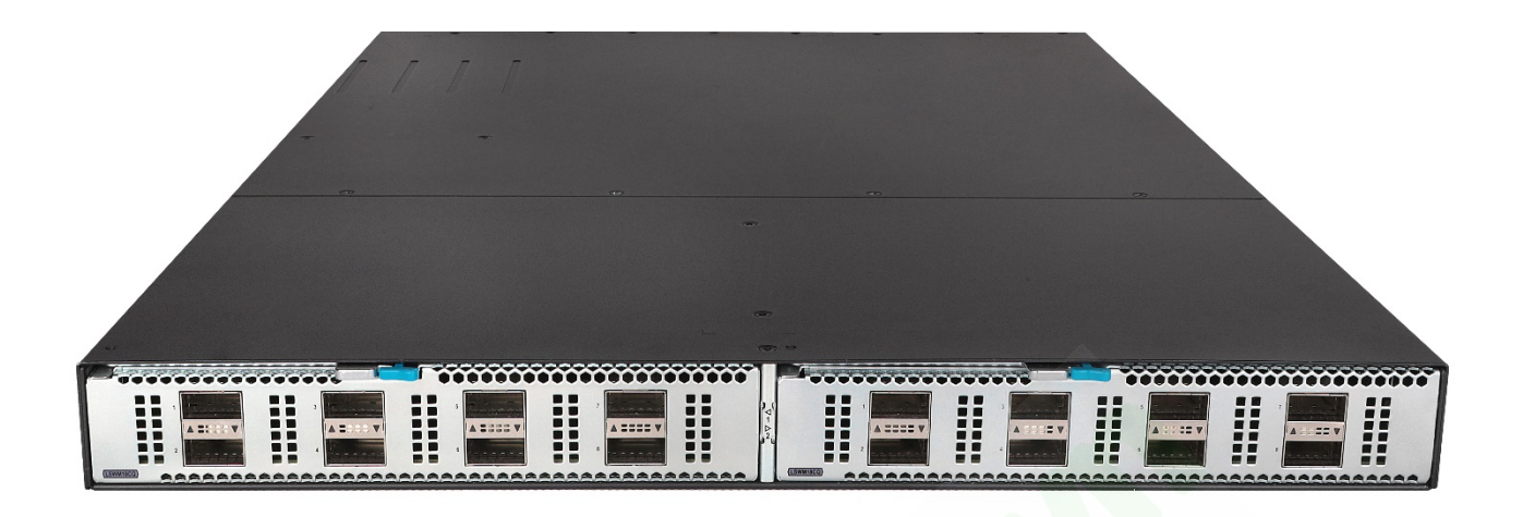
HPE FlexFabric 5945 2-slot Switch (JQ075A)