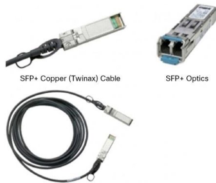
Figure 5. Cisco 10GBASE SFP+ Modules

Cisco 10-Gbps Ethernet SFP+ modules (Figure 5) provide 10-Gbps Ethernet connectivity for the Cisco MDS 9500 10-Gbps 8-Port FCoE Module and MDS 9250i Multiservice Fabric Switch.