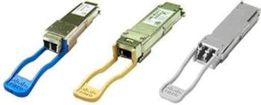
Figure 6. Cisco 40GBASE SFP+ Modules

Three types of 40GBASE QSFP modules are supported for MDS 40-Gbps line cards (Figure 6).