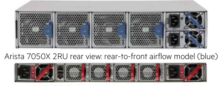
Arista 7050X 1RU rear view: rear-to-front airflow model (blue), front-to-rear airflow (red)