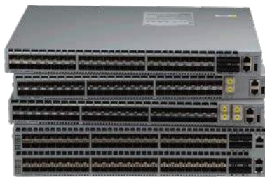
Arista 7050SX series of 1/10GbE and 10/40GbE switches. Top to bottom: 7050SX-64, 7050SX-72, 7050SX-96, 7050SX-128

Combined with Arista EOS, the 7050X series delivers advanced features for big data, cloud, and virtualized and traditional designs.