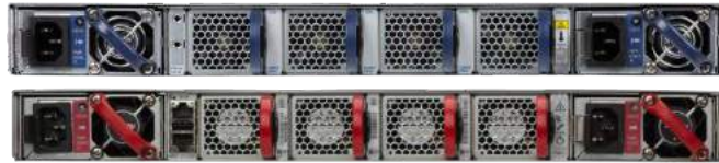
Arista 7050X 1RU Rear View: Rear-to-front airflow model (blue) Front-to-rear airflow (red)