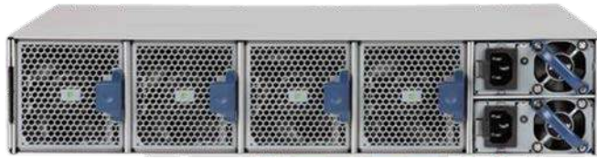
Arista 7050X 2RU Rear View: Rear-to-front airflow model (blue)