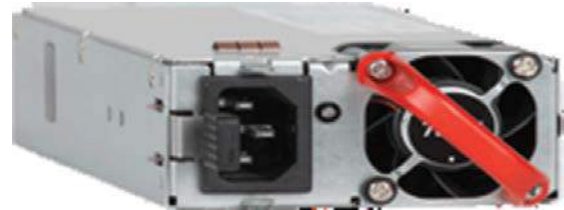
Hot swap power supplies