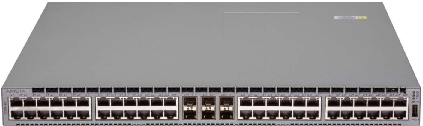
Arista 7020TR: 48 port 100/1000 Mb and 6 port 10GbE Switch

Combined with Arista EOS, the 7020R series delivers advanced features for big data, cloud, virtualized, and traditional designs together with enhancements for video streaming, media, and entertainment.