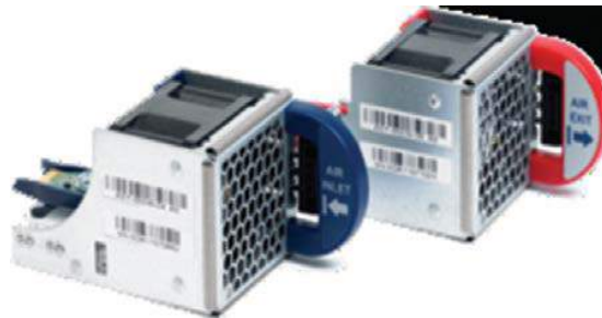
Hot swap fan modules