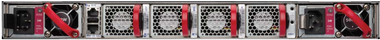
Arista 7020TR-48 and 7020TRA-48 1RU Rear View: Front to Rear