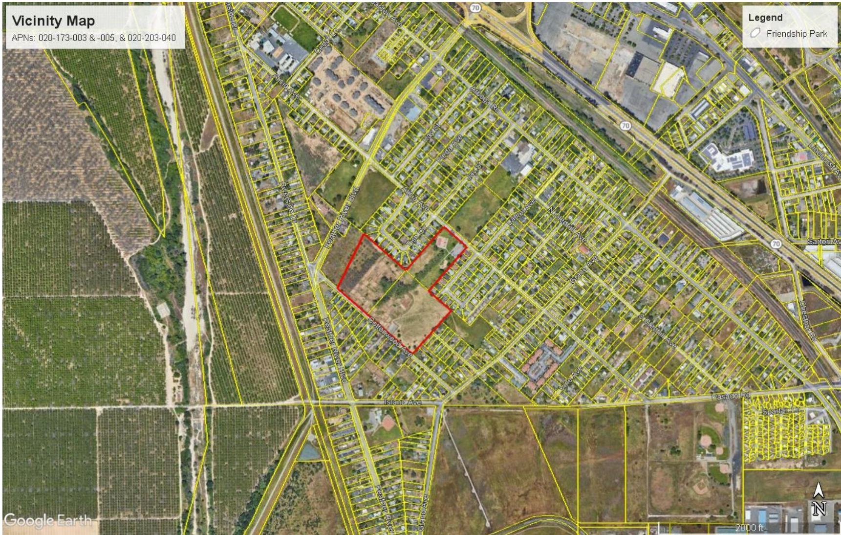
Figure 1: Project Vicinity