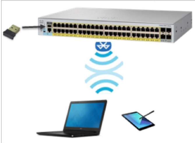
Figure 2. Over-the-air switch access using Bluetooth