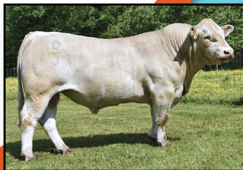
Lot 70 // DC/JDJ Pegasus D330 P

• The 2nd high selling bull in the 2018 DeBruycker bull sale at $17,000, this sire is rapidly proving his worth as his first calf crop is awesome. They are extremely correct, very thick, and very stylish in conformation. You will love your calves by him. One of Zeus' best sons!