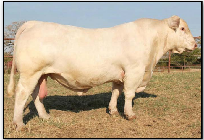
M6 New Standard 842 P ET // Sire of lot 2

• Selling Full Interest and Full Possession. Fertility and Trich Tested. Another very impressive New Standard son from one of Welcome Grove's most notable cow families, the Impressive 405. He ranks in the top 15% for both WW and YW, 20% for Milk, 8% MTL, 1% SC, 7% CW, 10% REA, and 15% TSI for breed EPDs. The dam of Lot 3 is the maternal granddam 405, of this stout sire. Another very powerful prospect that can lead a herd forward!