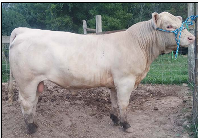
Lot 7 // CC Mr Firewater F02