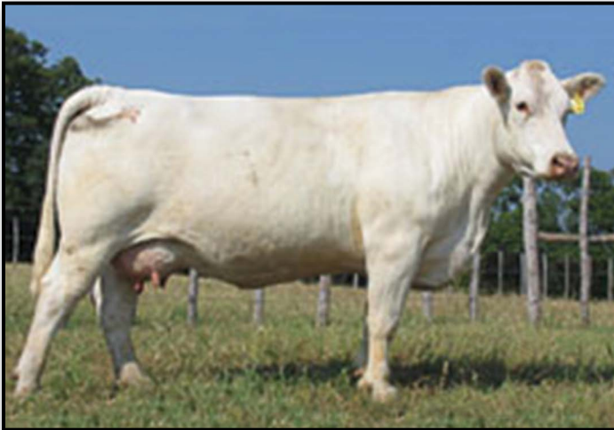
SR Lady Ease 914 ET // Maternal granddam of lot 35 Dam of SR/NC Field Rep 2158 P