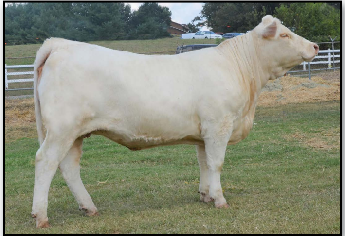
Lot 31 // Welcome Grove Lucy 1807

Sells Open. A very eye-appealing prospect with tremendous numbers, including a top 8% for Milk EPDs, a top 6% MTL, 25% REA, and 20% Fat for the breed comparisons. Fresh Air daughters have beautiful udder quality and the Passport offspring have the great Smokester background, a many time Milk Trait Leader. A very feminine heifer, ideal to add to a fall program.