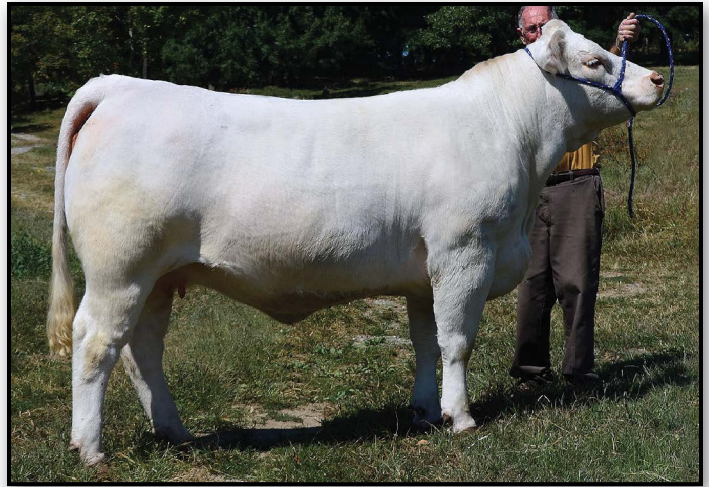
Welcome Grove Impressive // Dam of lot 30

Sells 3 1/2 Months safe in calf to Bamboo Passport 1327, EM815568 on sale day. Dam is the very impressive show heifer that Silas campaigned out of BHD Reality T3136 P, a maternal sib to BHD Zeus. This represents one of the best cow families at Welcome Grove. Balanced EPDs makes her an excellent choice. The 488 cow has produced many major herd sires, including the CR Smokester 488B for Cavendar Ranch, TX.