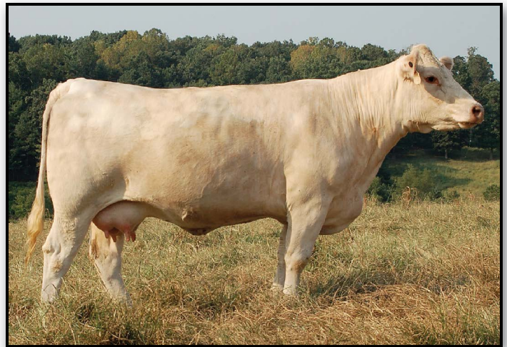
SRC Miranda U805 // Dam of lot 56