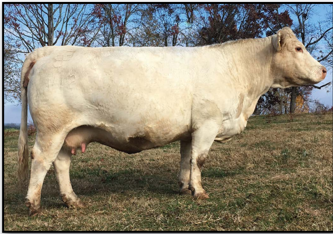
EB Miss 3313 514 ET Pld // Dam of lots 11 & 12