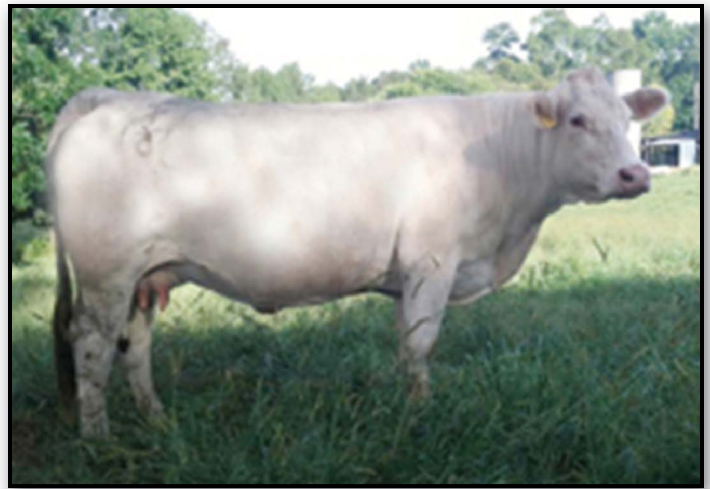
CJC Ms Royal T T161 // Dam of lot 16