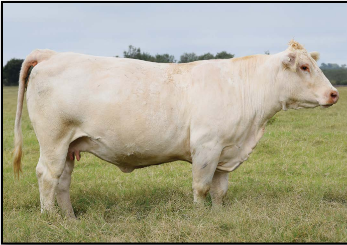
Double H Legends Angel 125Y ET // Dam of lot 53