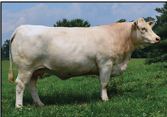
RHC Vanessa 102 //

Full sister to lot 40; maternal sister to lots 41 & 42