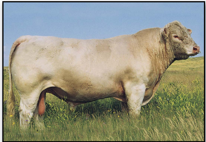
LT Wyoming Wind 4020 PLD // Sire of lots 42 & 66

• Ali Duke 175 was used in Oak Hill ET program, Hayden's program, and now owned by Ezy-B Farms, TN. This Duke 914 cow mated to Wind produced outstanding broodcows with superior milking abilities and maternal ability. Wind is note for adding great eye-appeal and phenotype to his progeny