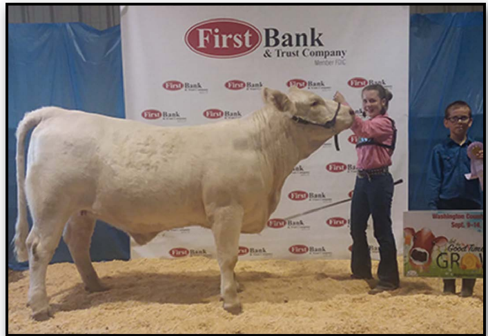
Lot 27 // HF Lady Ease 81 P