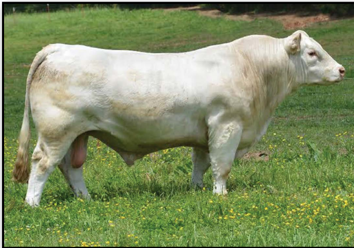
JDJ Maximo A18 P // Homozygous Polled Sire of lots 13, 14, 15, 25, 50 & 51