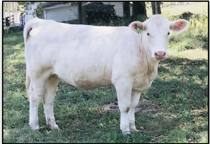
Lot 24 // LMH Hedi