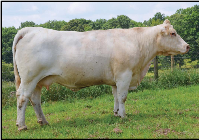
Lot 40 // OHF Lady J227P