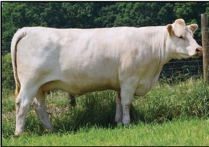
Lot 41 // OHF Windy E904 ET