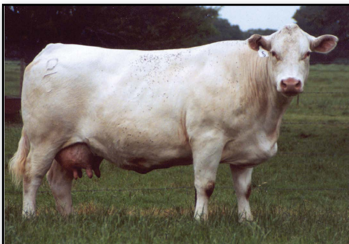
JD Miss Commander B309 // "Miss American Beef" Donor dam of Julieta 1N5 B309 Y 46 ET