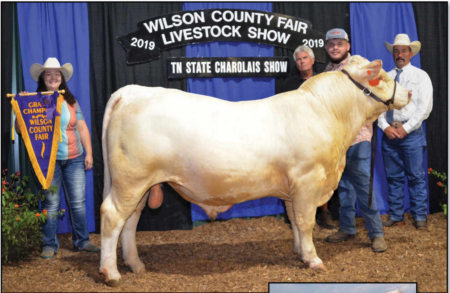
Lot 1 // Reeves Standard G 0806