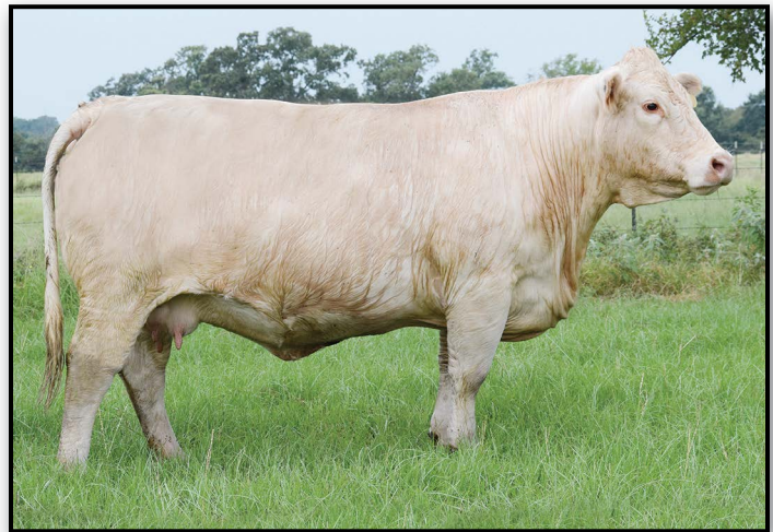
AC Ms Cigars Illusion // Dam of lot 68

• Many are anxiously waiting for their first calves sired by Braxton to be born in the U.S. this spring. He is in a limited syndication in the U.S. Braxton was the high selling bull in Canada in 2016 at $106,000. His calves in Canada have been awesome! 274 is a massive cow with tremendous scale, size, bone, muscling and correctness. She milks heavily, great fertility, and very feminine for her size and scale.