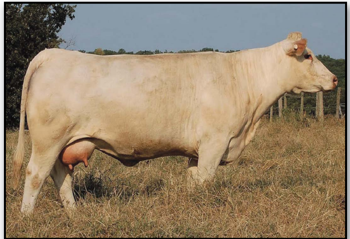
OHF Vannar G123P // Dam of lot 44 and now in the ET program of Buzhardt Farms, SC