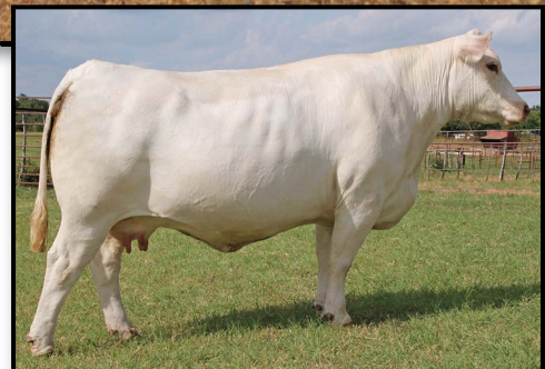
M6 Cool Germaine 1145 P ET // Dam of lot 1