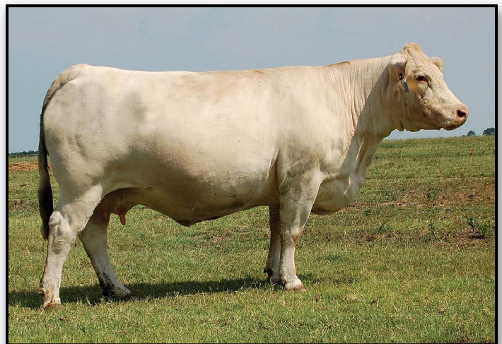
Three Trees Vanna 2856 ET // Donor dam of the embryo carried by lot 52