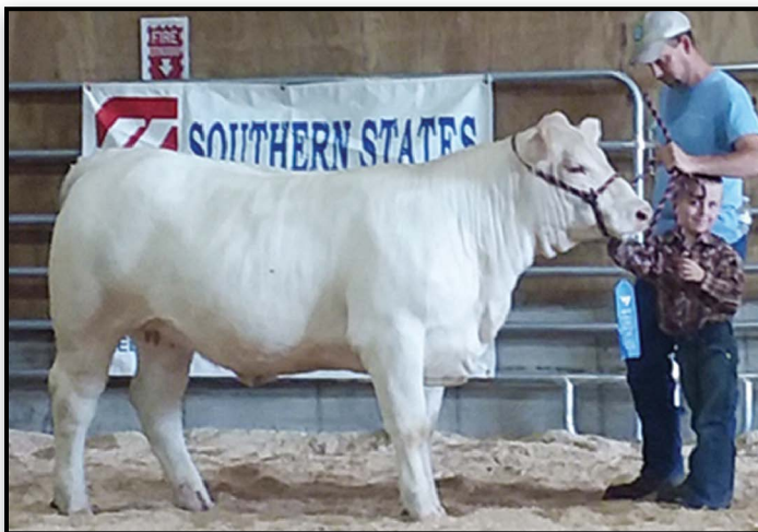
Lot 29 // CC Miss Raindance F04