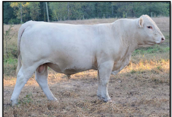
Lot 4 // RRCA Mr E307