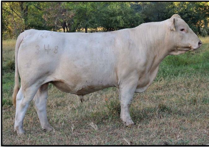
Lot 5 // RRCA Mr F348