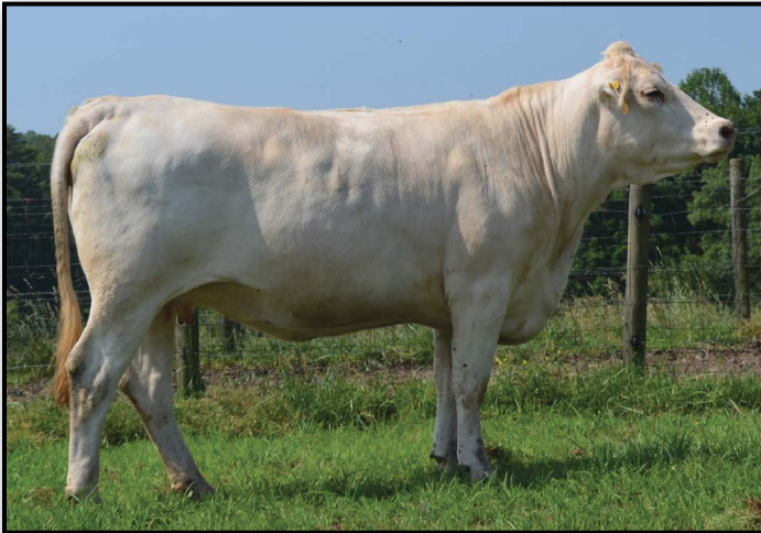
Lot 54 // OHF Gale 1624