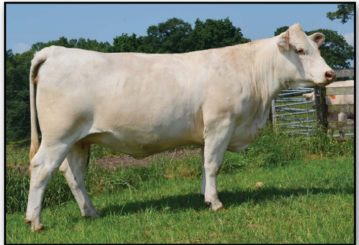
Lot 51 // RE Perfect Max 577