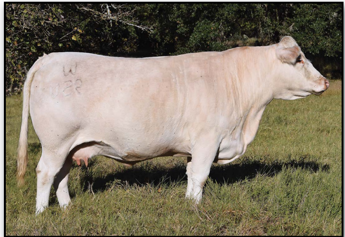
BHD DS Rachel Alex 950 ET // Dam of lot 67

• Rachel Alex is a full sib to CJC Mr President T122, a massive cow with beautiful udder quality and attachment. A very fertile donor that produces over 20 embryos per flush. Her calves, regardless of sire have all been outstanding. A very easy fleshing cow. King was the high selling bull in the 2019 DeBruycker bull sale at $23,000. His dam is one of the most outstanding cows in the breed. This should be an awesome product!