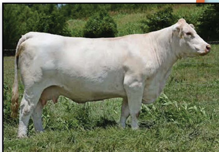
M6 Ms E46 Quality 441 ET // Dam of lot 69

• Ms Quality 4142 was the dam of the $17,000 high selling heifer in the very first President & Reality sale. She has produced a multitude of top end offspring that have topped markets. Her progeny is scattered all over the U.S. She has an awesome udder quality and has 40 progenies registered with AICA. Evolution calves are remarkable in thickness and style. They add a great deal performance, bone, and muscling. They are selling very well!