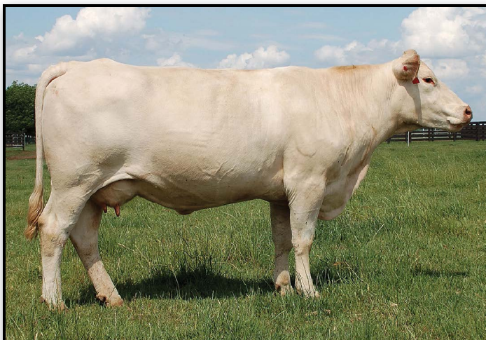
OHF Vanessa 488 ET // Dam of lot 62