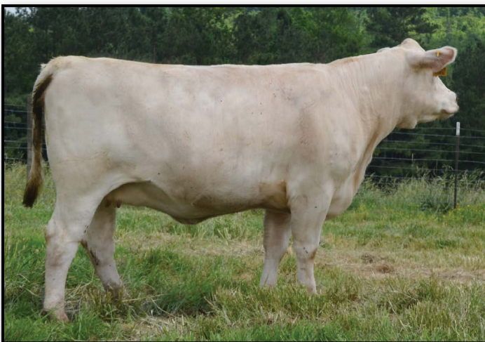
Lot 49 // OHF Lady F903