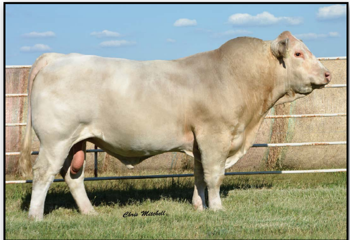
BHD Asset B178 P // Sire of lots 6, 26, 36 & 53