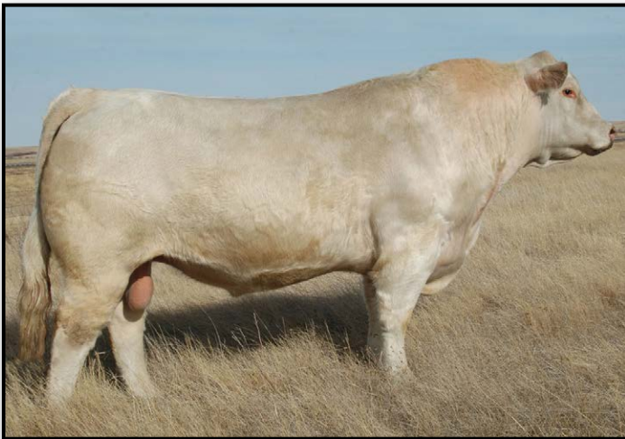
LT Ledger 0332 P // Sire of lots 21, 22, 44 & 64