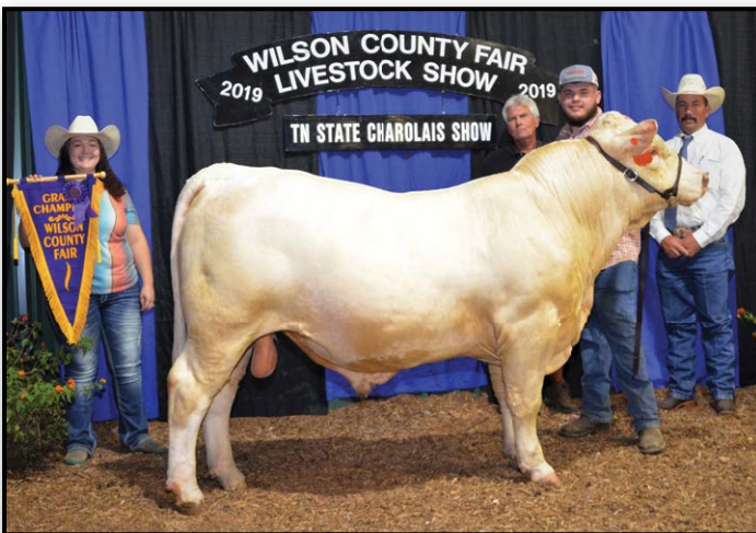
Reaves Standard G. 0806 // Service sire of lots 33 & 36