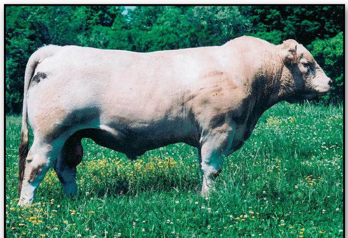
Lot 59 // GP Stogie M16 ET

Please bring your semen tank! Semen & Embryos from Oak Hill Farms will be at the sale.