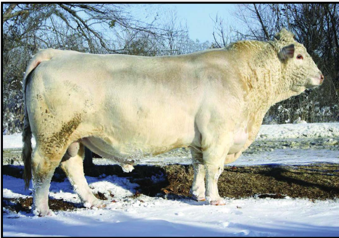
SR/NC Field Rep 0127 PLD // Grandsire of lots 47 & 48