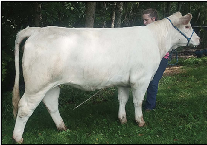
Lot 28 // CC Miss Duchess F03