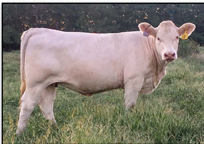
Lot 11 // JBC Ms Duke 809 P.ET