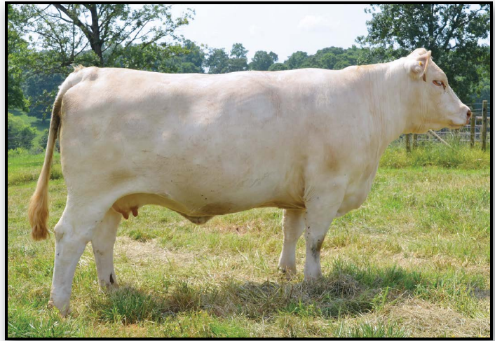
Lot 37 // OHF She Smoking D823 ET