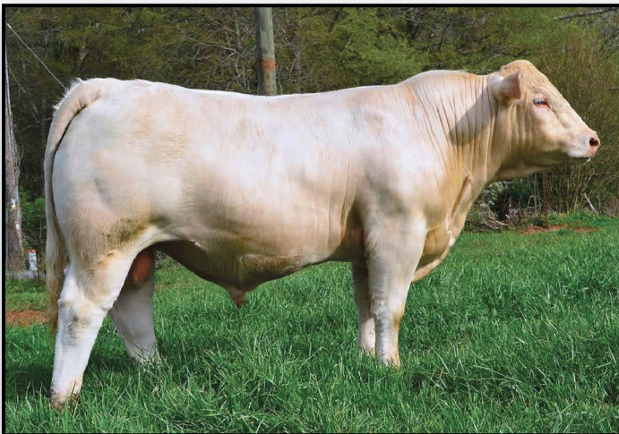
WC Vulcain 422 P ET // Sire of lot 55