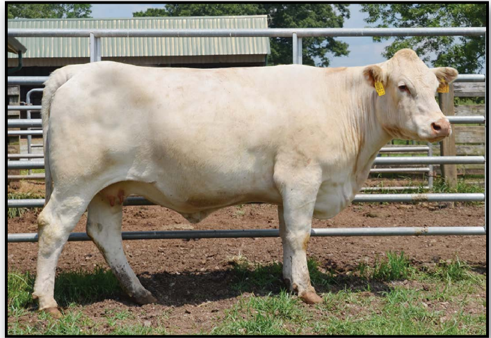
Lot 38 // OHF Vanessa E916 ET