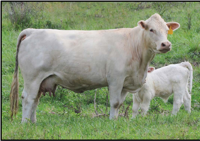
M6 Ms Fresh Density 233 P // Dam of lot 34