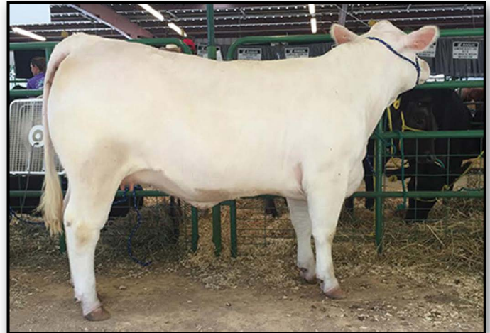
MR Ms Impressive 405 // Dam of lot 3

• Selling Full Interest and Full Possession. Fertility and Trich Tested. Out of the very proven WC Milestone, a cornerstone of the Wright program. Impressive 405 has produced many Champions for Welcome Grove and has been a part of their elite ET program and has 24 calves registered with AICA. As with many "great-ones", she traces to LHD Cigar, as does TR Firewater 5792R ET. Build a strong cow herd with a sire from a great dam!