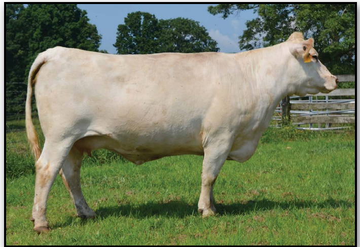
Lot 43 // OHF Oak Lady C902