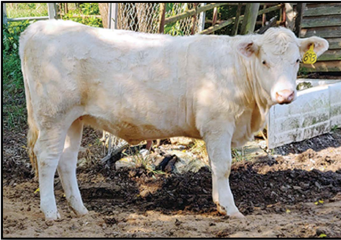
Lot 20 // WC Susie Q 893