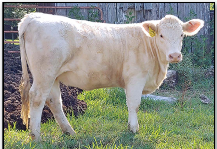
Lot 19 // WC Dixie 852