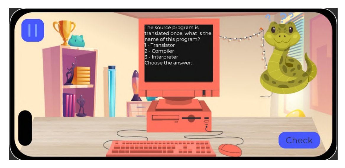
Figure 5: Gameplay of PythonLeaner.

learning other popular programming languages without changing the code. To check the code entered by the player, binding to each level of answers in the game engine was implemented, but this option is not very good, therefore, in the future of the game, we plan to implement an interpreter-based or artificial intelligence system in the game to automatically check the player's code. This innovative technology will allow us to effectively detect errors, optimize the work of players and ensure a high level of security in the game. The compiler or artificial intelligence will be responsible for analyzing the syntax, structure, and efficiency of the code, thus ensuring a higher quality of game software and reducing the possibility of vulnerabilities or anomalies.