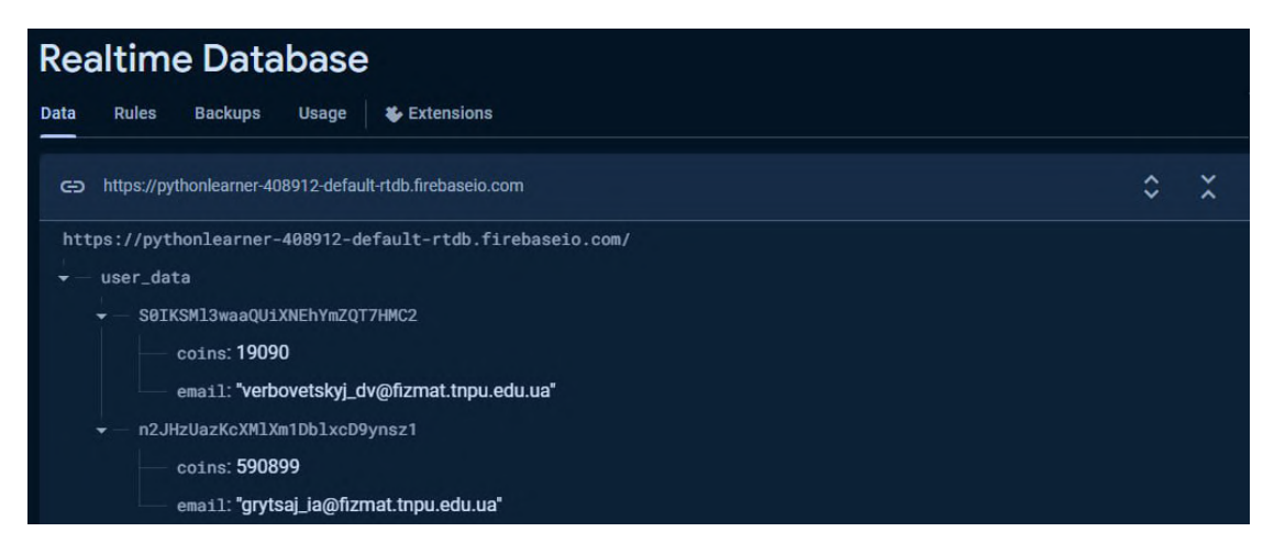
Figure 3: Rating saved in Firebase.

developers in building and scaling software products. The database for storing the rating required the installation of the SDK (FirebaseDatabase.unitypackage), as shown in the figure 3.