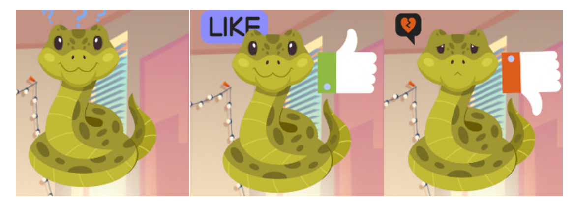
Figure 4: Reaction to the player's response.

The IdleAnimation(), LikeAnimation(), DislikeAnimation() methods were used to implement the action of assistant (figure 4).