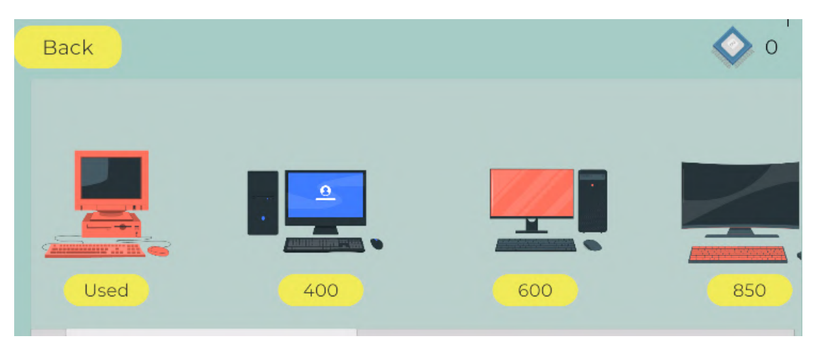
Figure 6: PythonLeaner Game Store.

• after completing each level, the player receives a specific number of points. These points can be exchanged in the future for the graphic design of the game environment. The elements can be purchased at any time in the store (figure 6).