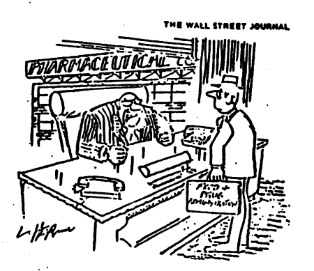
"Those pills have made us a profit of five million dollars and you people call them worthless?"

In 1962, FDA proposed to put a stop to the vitamin explosion by the direct means of outlawing the most popular products. Under the regulations, which were finalized in 1966, products would be permitted to contain only certain vitamins and minerals, and then only at levels within the range of officially recommended daily allowances. All other products (namely most of the ones actually available) would be prohibited. Even the approved products would be branded as useless, for the front label would have to proclaim that ordinary foods provided "abundant amounts" of vitamins and minerals and that there was "no scientific basis" for the routine use of dietary supplements.