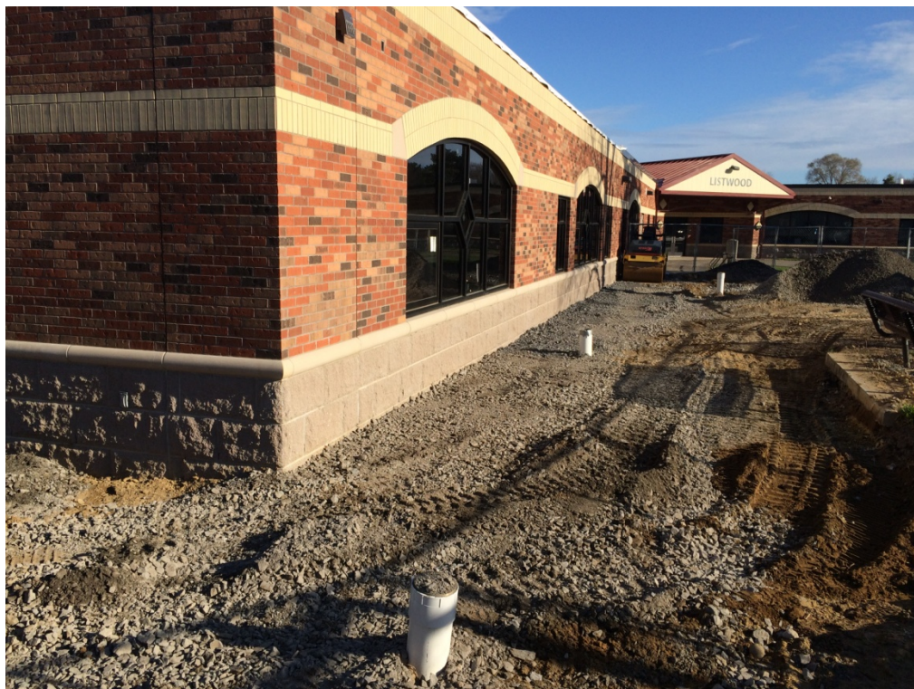
Listwood – Prep for Sidewalks