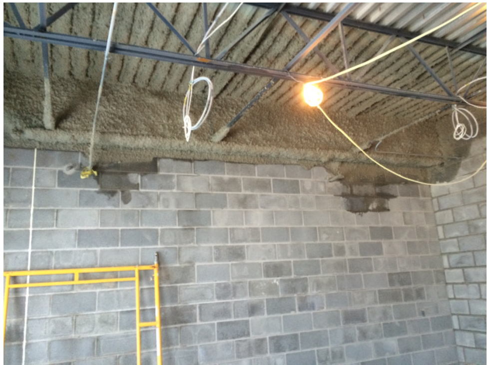
Colebrook – Fire Insulation Above Ceiling