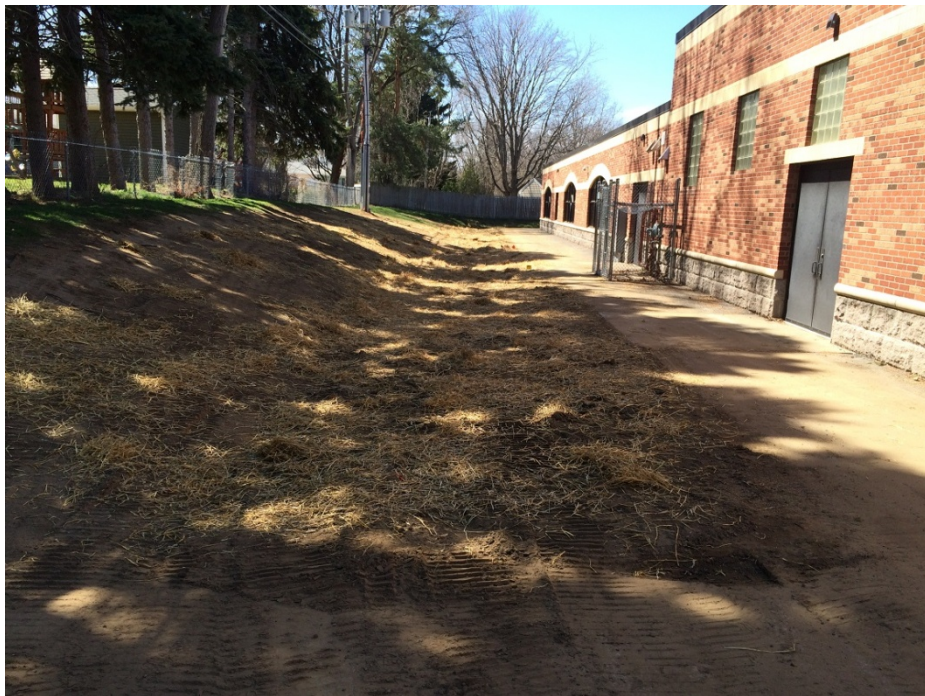
Brookview – Behind Building