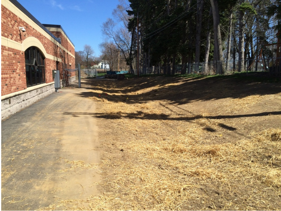
Brookview – Behind Building