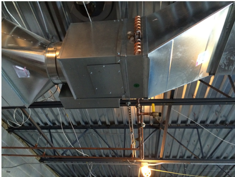
Colebrook – HVAC Duct Installation