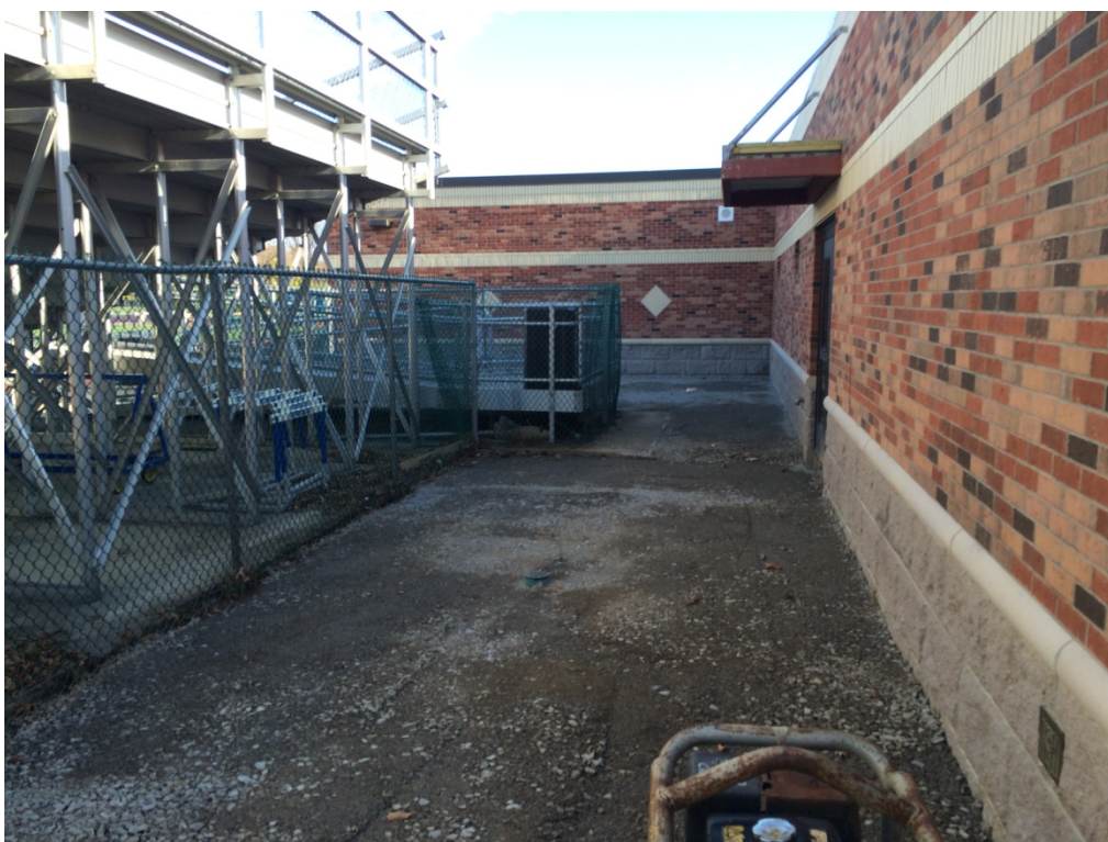
Listwood – Prep for Sidewalks