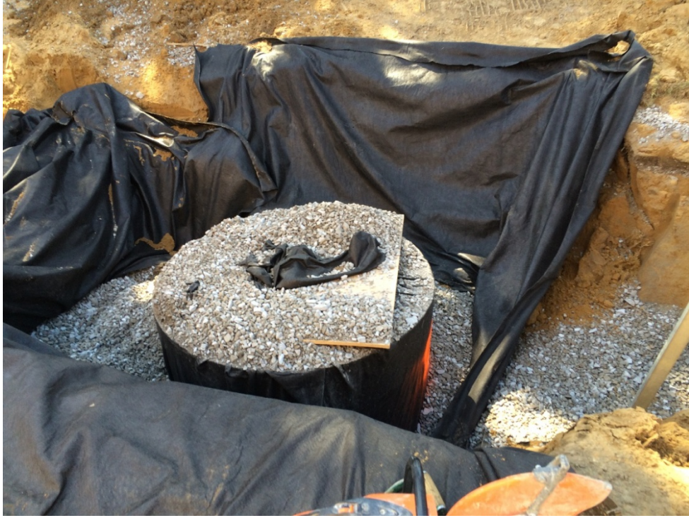
Brookview – Dry Well Installation