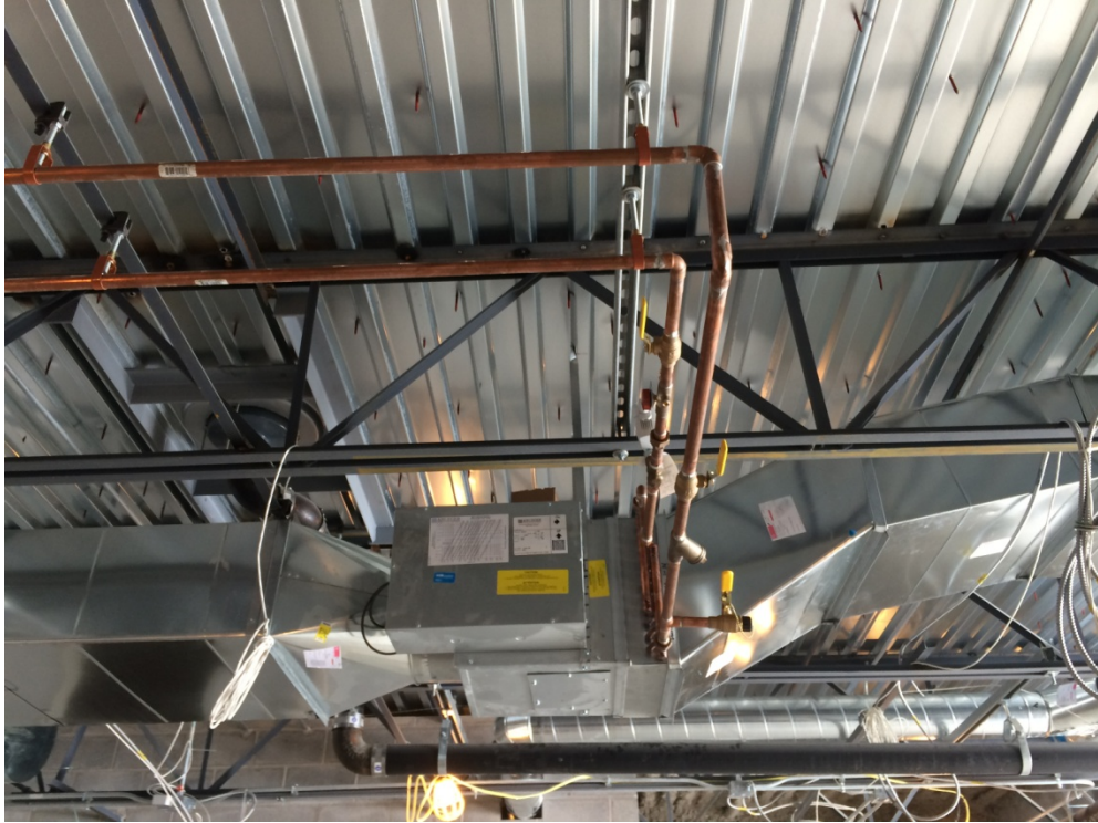
Colebrook – HVAC Heat Pipe Installation