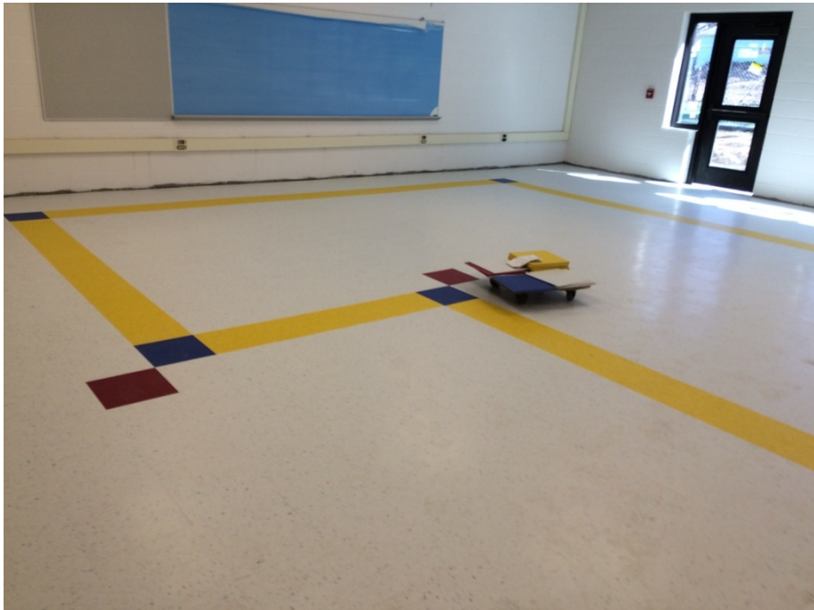
Brookview - VCT