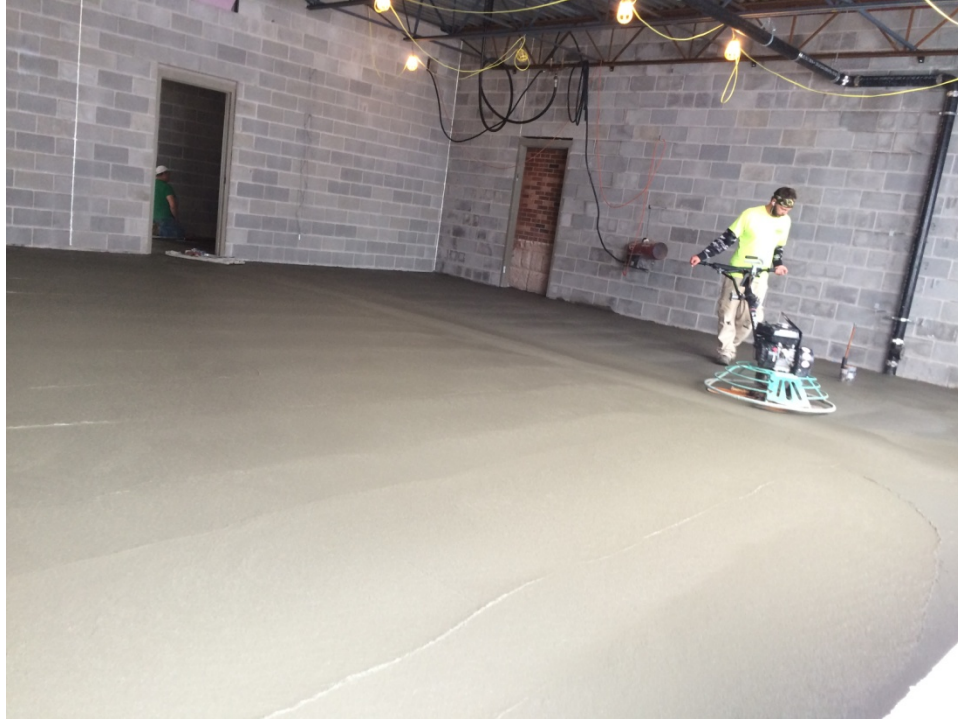
Colebrook – SOG Concrete Finishing