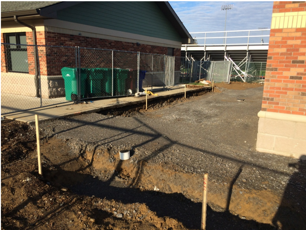
Listwood – Prep for Curb/Retaining Wall