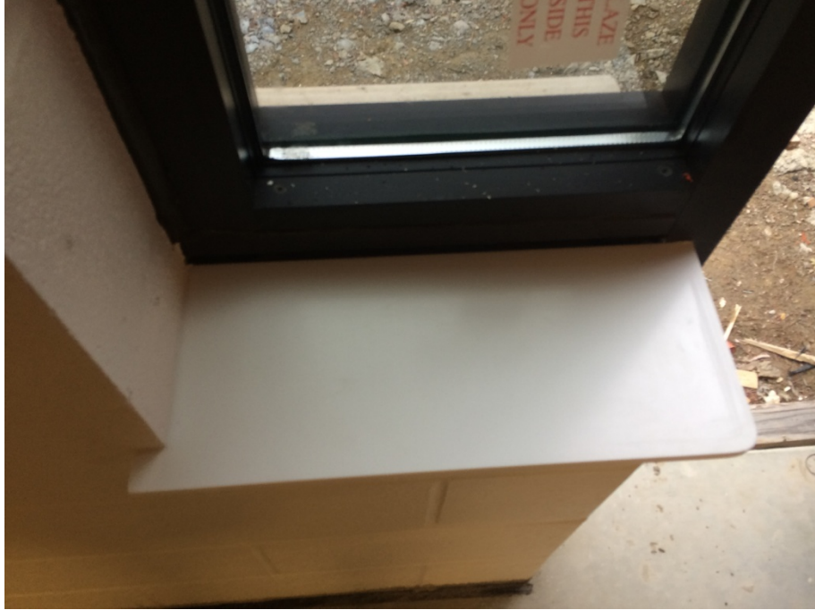
Briarwood – Sill Detail All K-3 Schools