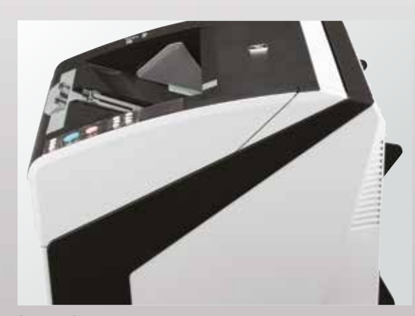
fi-6800 side view

Automated routines deliver a performance bonus to document-hungry businesses when archiving records, satisfying compliance requirements and introducing ad hoc documents to workflows. The result is a robust scanner that reduces the total cost of ownership and provides a fast return on investment.