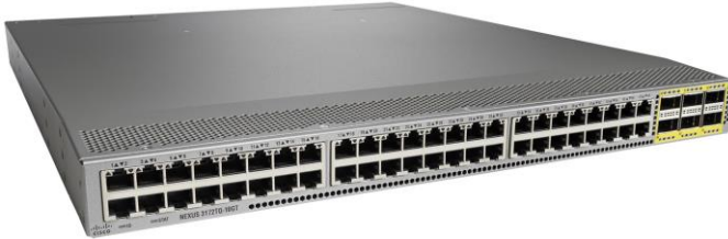
Figure 2. Cisco Nexus 3172TQ and 3172TQ-32T Switch