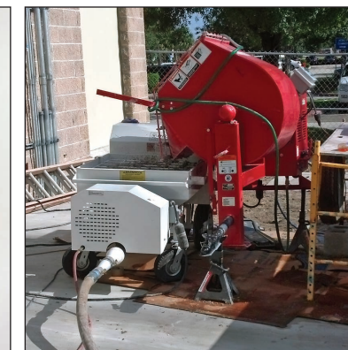
Works well with standard mixer