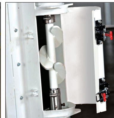
Removable hopper bottom offers easy cleanout of the hopper and makes maintenance easy