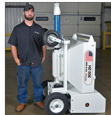
Portability – will easily stand on end to fit into a service elevator