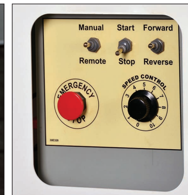
Simple, easy-to-use controls