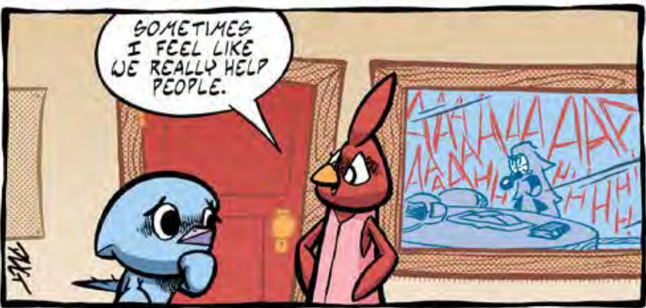
© 2021 • Douglas Laubacher • iNKWiTs.com