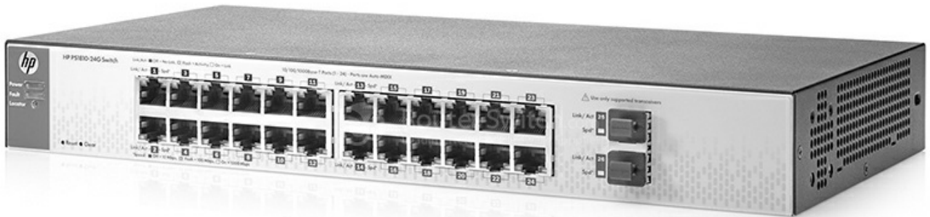
Table 1 shows the quick spec.

Figure 1 shows the appearance of HPE J9834A.