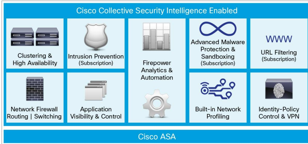
Figure 1. Cisco ASA with FirePOWER Services: Key Security Features