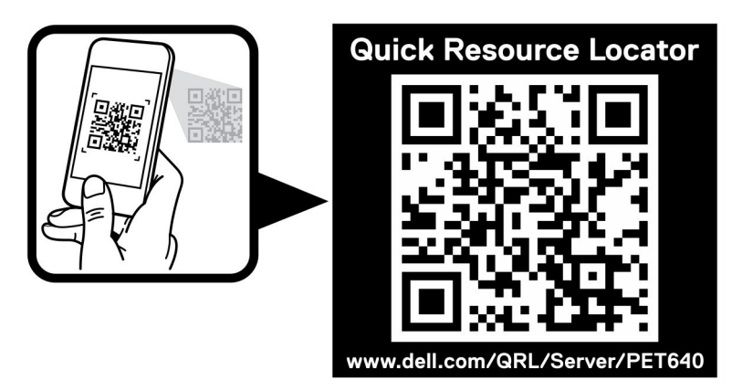
Figure 2. Quick Resource Locator for PowerEdge T640