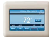
TSTAT0201CW Recommended (sold separately)

* Applies to original purchaser/homeowner, some limitations may apply. See Warranty certificate for complete details.