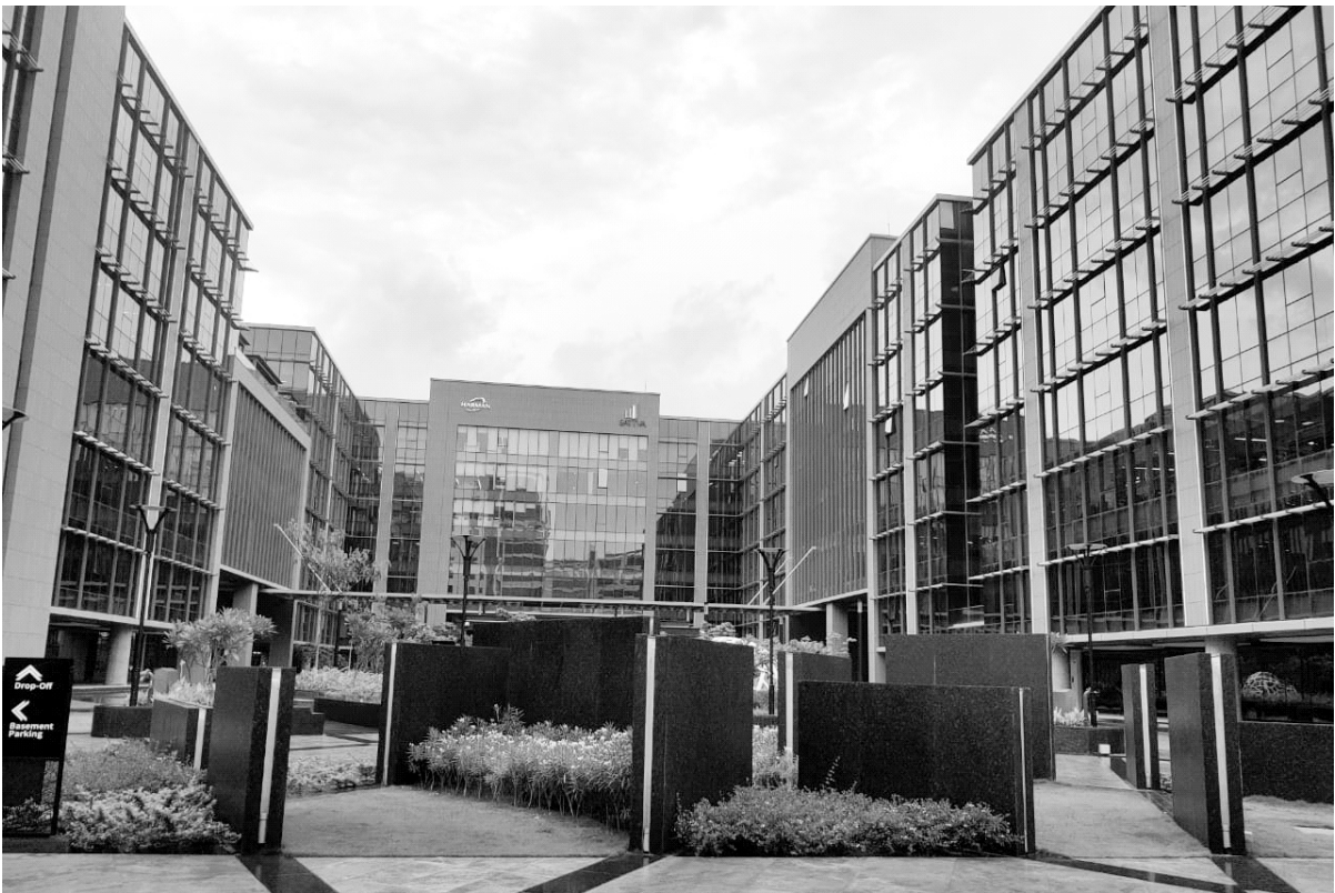
Sattva Knowledge Court Commercial Building for M/s Darshita Hi-Rise Pvt Ltd at Bengaluru, Karnataka.