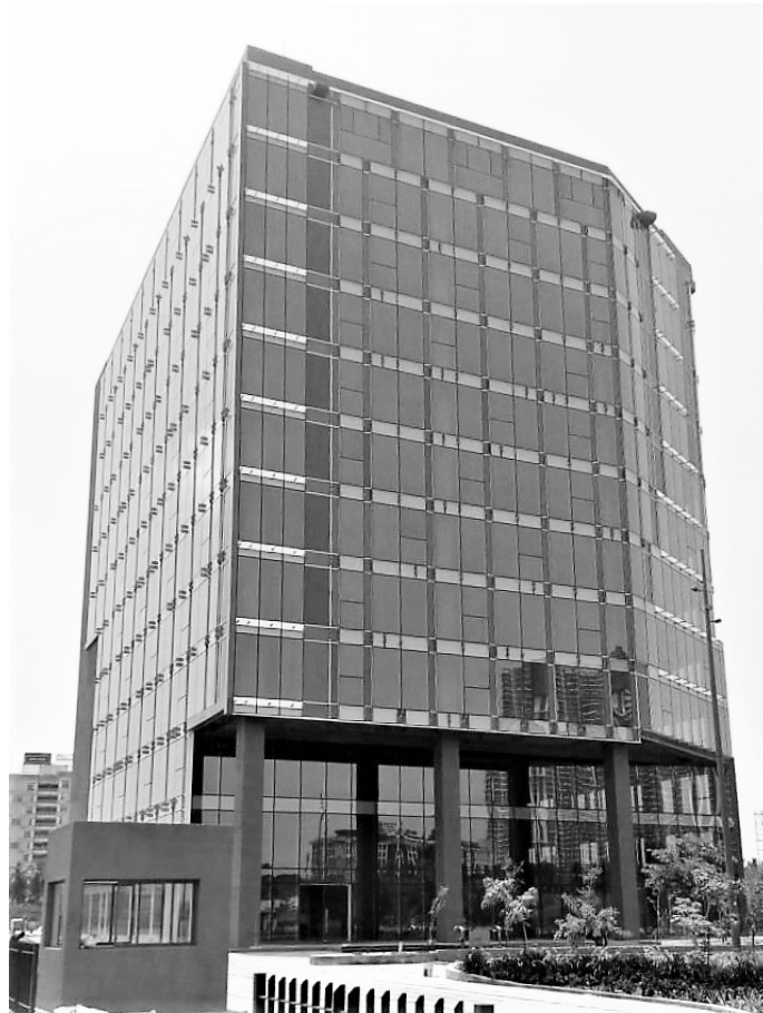
South West Multi-use Retail (SWMR) -Commercial Building for M/s Karle Infra Pvt Ltd at Bengaluru, Karnataka.

► CREATIVE ► COMMITTED ► CUSTOMER FOCUSED