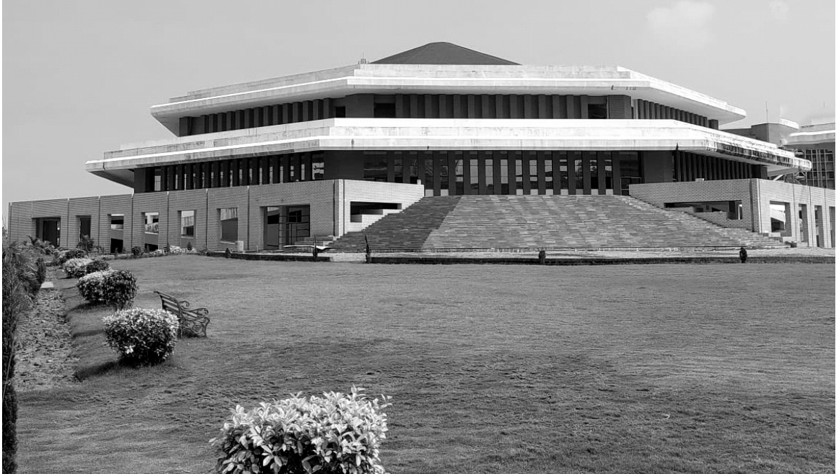
Auditorium / Lecture Hall Building for M/s Xavier University at Bhubaneswar, Odisha