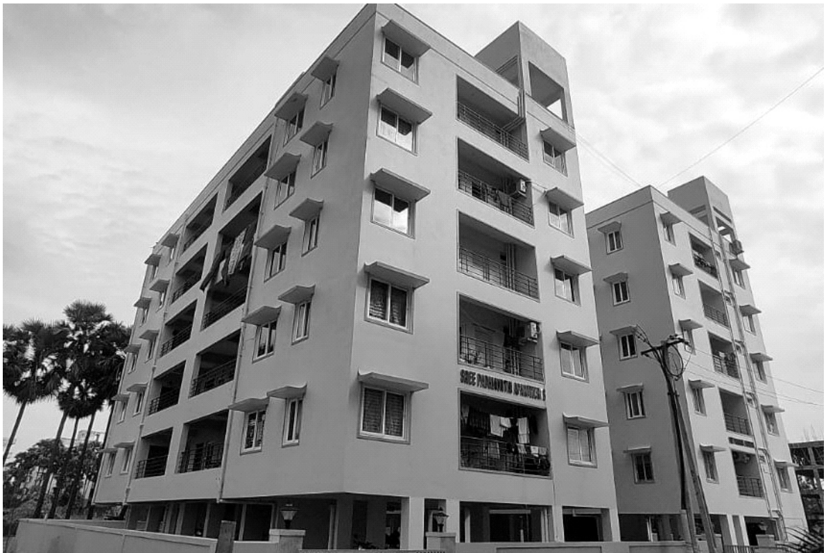
Dhaathri Apartment Building for M/s Dhaathri Constructions at Visakhapatnam, Andhra Pradesh.