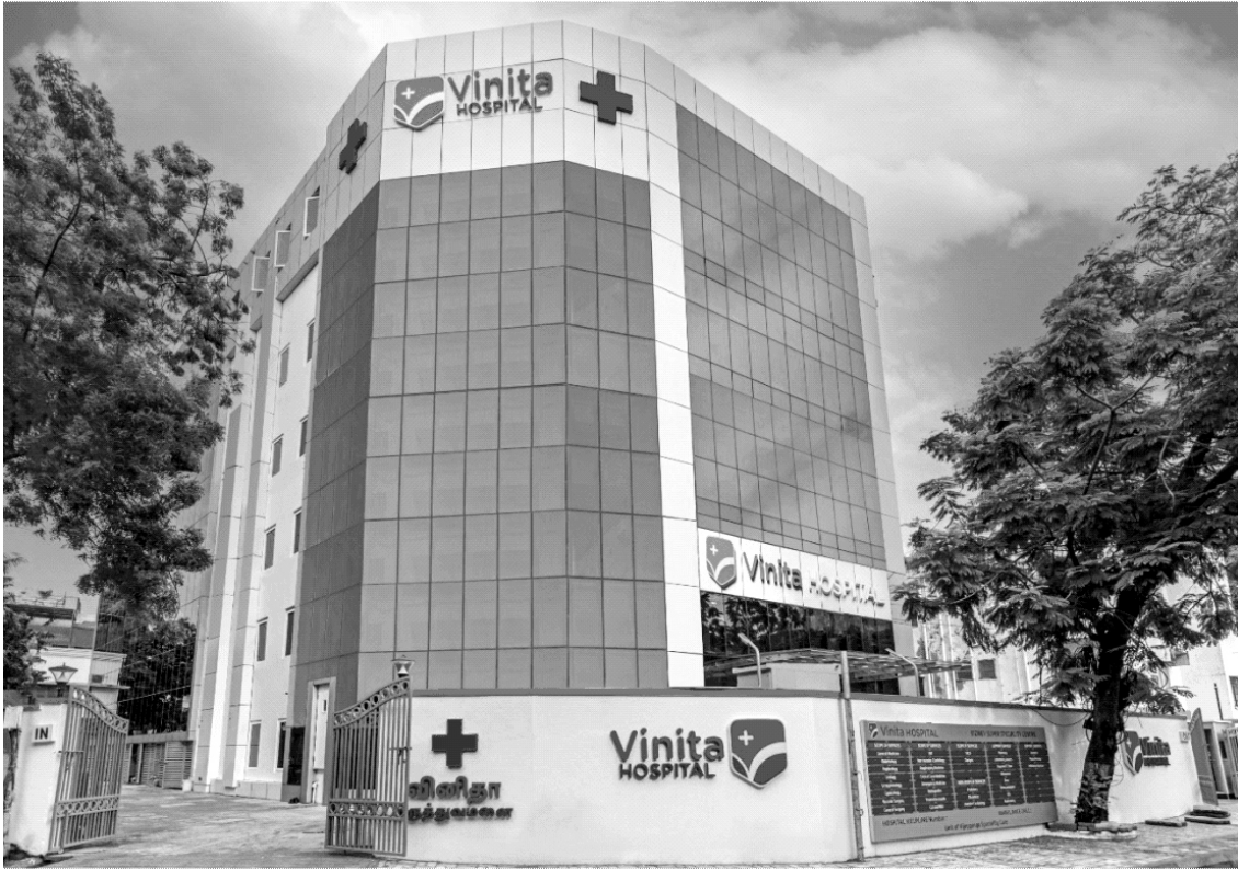
Vinita Hospital for M/s Vijay ganga Speciality Care at Nungambakkam, Chennai.