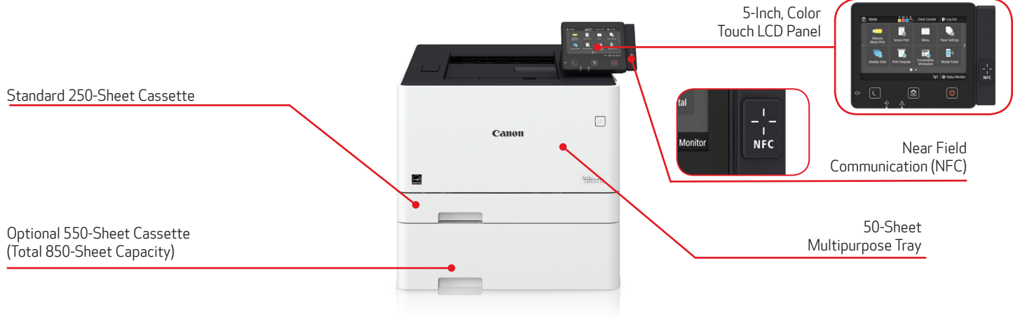
LBP654Cdw shown with optional 550-sheet cassette.